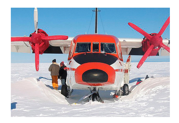
Casa 212 Insulated Engine & Propellor/Spinner Covers