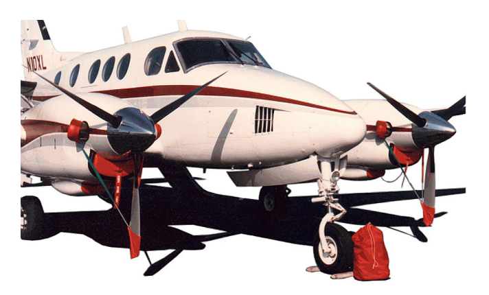
Pitot, Exhaust Covers, Engine Plugs & Prop Ties