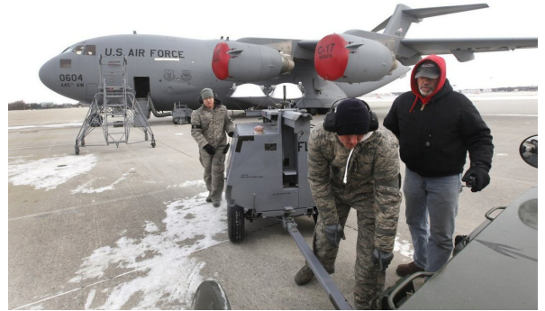
C-17 Globemaster Exhaust Cover and Bypass Vent Plugs, folding type