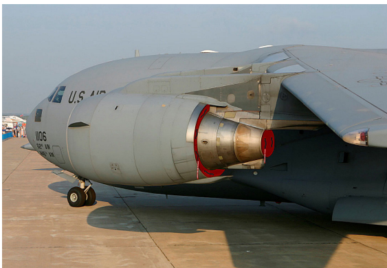
C-17 Bypass and Exhaust Plugs (illustration)

The Engine Inlet Plugs are custom fit for your McDonnell Douglas Globemaster C-17 intakes, made with heavy-duty vinyl material, and stuffed with a single block of sculpted urethane foam. Each plug has a zipper that allows the foam to be removed and dried if necessary. Engine plugs have 'remove before flight' streamers sewn onto the face of the plugs. Most plugs are imprinted with the aircraft registration number in black for an extra charge. Storage bag NOT included. Engine plugs may be inserted after flight when the engine is still warm. Engine Inlet Plugs are commonly referred to as Cowl Plugs, Intake Plugs, Cowl Blocks, Engine Blocks, and Engine Bunges.