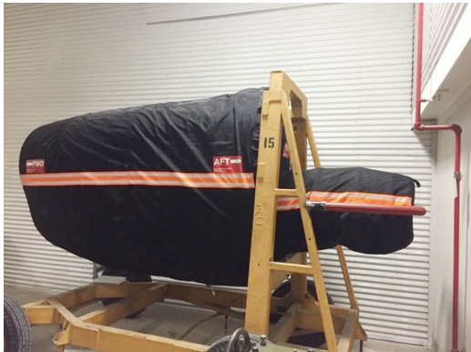
C-130 QEC / Maintenance Cover Set

This cover type is made from Silver Acrylic Sunbrella canvas and is 100% lined with a soft and smooth microfiber. Bruce's Custom Covers developed this material combination especially for aircraft protection. The outer material is medium weight and treated for water resistance, UV resistance and anti-static buildup. The inner lining is a very soft and smooth microfiber to prevent scratching. The material is very reflective, and tests show that the cabin interior temperature can be reduced to near-ambient temperature on the hottest of days. It is water, ice and snow repellent, yet breathable to allow moisture to escape from between the cover and the aircraft surface.