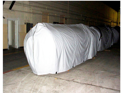
C-130 Aux. Fuel Tank Covers