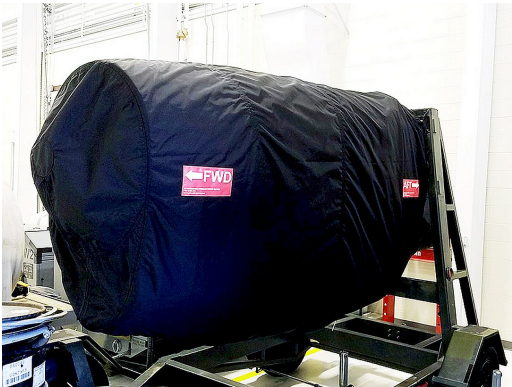
C-130 QEC / Maintenance Cover Set