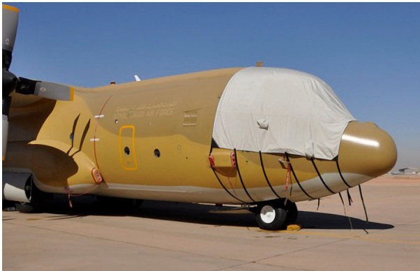
C-130 Cockpit Cover (Windshield/Flight Deck)