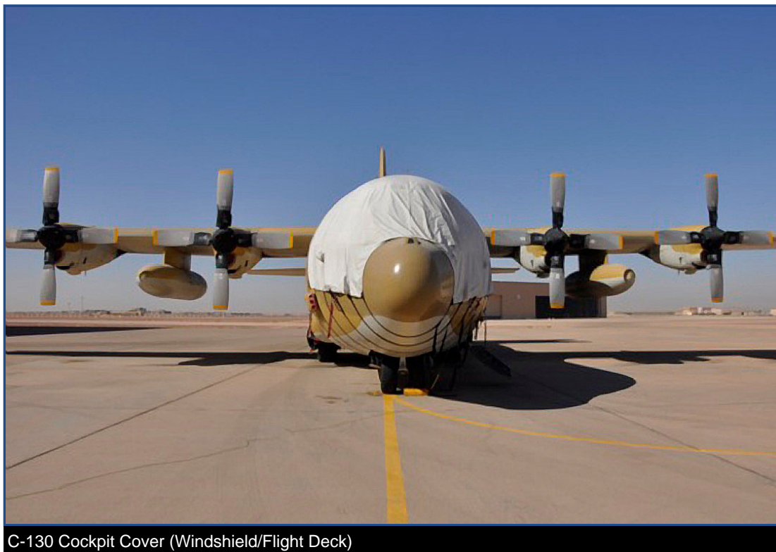
C-130 Cockpit Cover (Windshield/Flight Deck)