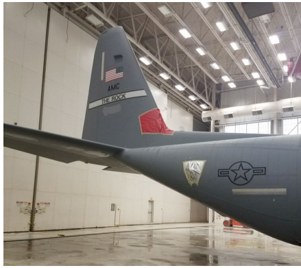
C-130 Vertical De-Ice Boot Cover