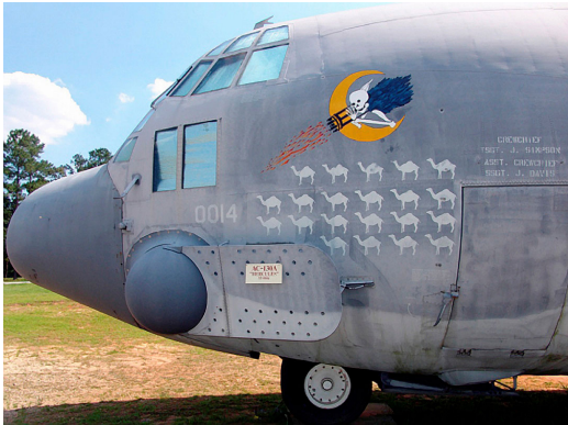
Lockheed AC-130A Flight Deck HeatShield Set