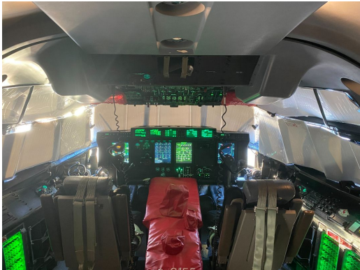
Lookheed C-130 Hercules Flight Deck Heatshield Set

Windshield and Skylight Heatshields are interior sunshades for an aircraft's front windshield and overhead window. The product is a unique composite of closed-cell foam with a silver mylar finish. The semi-rigid design is stiff enough to stand along the inside of the windshield using sun visors or window framing. It folds up flat and easily stores in the included storage sleeve. Some designs may require velcro and suction cups or split right and left sides. A Heatshield is an excellent short-term remedy for cockpit overheating. An external fabric cover is far more effective and practical for long-term protection.