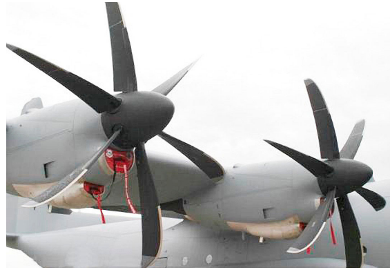
Heavy Duty Main Engine Inlet & Oil Cooler Inlet plugs w/ full color Squadron Insignia Patch artwork imprints