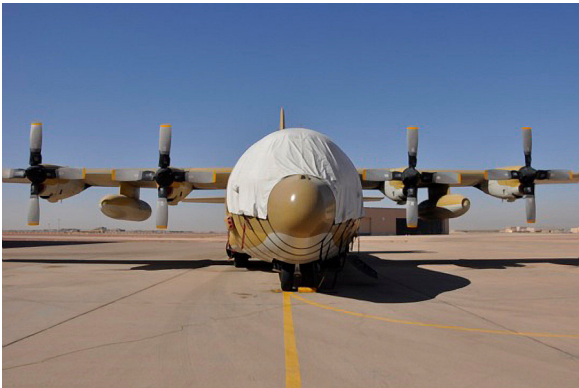
C-130 Cockpit Cover (Windshield/Flight Deck)