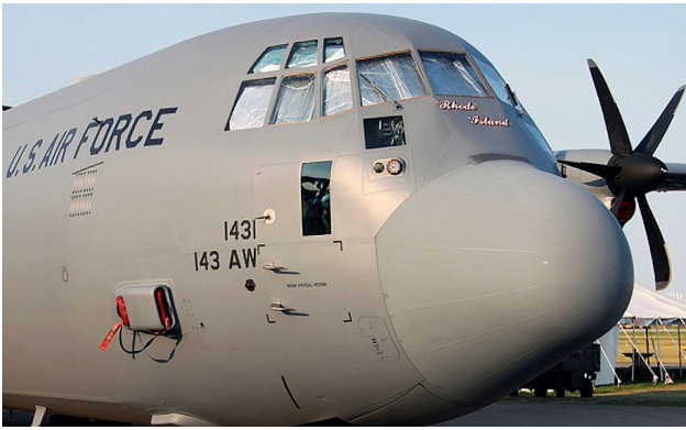
C-130 Cockpit HeatShields