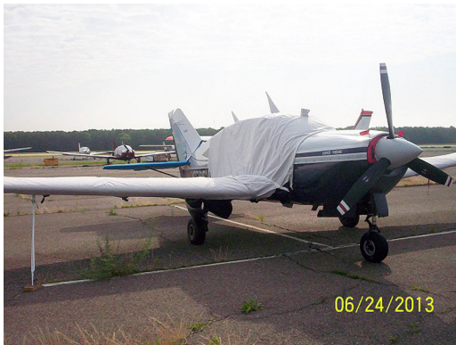
Bellanca Viking Canopy Cover with Wing Root Covers, Wing Covers, Engine Plugs

WINTER USE MATERIAL - Made with Solution-Dyed Polyester fabric, this option is intended for seasonal use to aid in deicing, rain mitigation, or for occasional travel. The material is lighter and more compact, but more susceptible to UV damage and may have a shorter useful life if used continuously outside than the all-year use material.