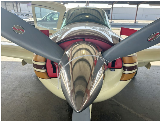
Bellanca Viking Engine Inlet Plugs

Engine Inlet Plugs are custom fit for your Bellanca Viking intakes, made with heavy-duty vinyl material, and stuffed with a single block of sculpted urethane foam. Each plug has a zipper that allows the foam to be removed and dried if necessary. Engine plugs have warning flags that are visible from the cockpit or 'remove before flight' streamers sewn onto the face of the plugs. Most plugs are imprinted with the aircraft registration number in black for an extra charge. Storage bag NOT included. Engine plugs may be inserted after flight when the engine is still warm. Engine Inlet Plugs are commonly referred to as Cowl Plugs, Intake Plugs, Cowl Blocks, Engine Blocks, and Engine Bungs.