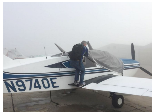
Bellanca Viking Travel Cover