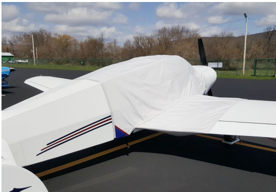
Bellanca Cruisemaster Extended Canopy Cover with 36" Wing Extensions.