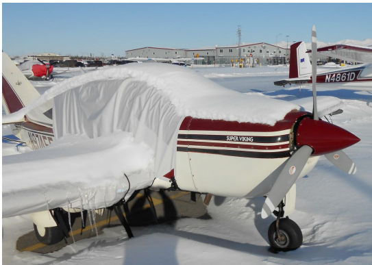
Bellanca Viking Extended Canopy Cover with 36" Wing Extensions, Wing Covers