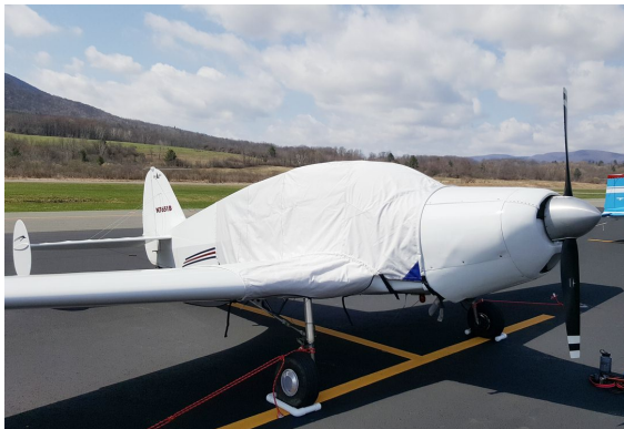
Bellanca Cruisemaster Extended Canopy Cover with 36" Wing Extensions.

This cover type is made from Silver Acrylic Sunbrella canvas and is 100% lined with a soft and smooth microfiber. Bruce's Custom Covers developed this material combination especially for aircraft protection. The outer material is medium weight and treated for water resistance, UV resistance and anti-static buildup. The inner lining is a very soft and smooth microfiber to prevent scratching. The material is very reflective, and tests show that the cabin interior temperature can be reduced to near-ambient temperature on the hottest of days. It is water, ice and snow repellent, yet breathable to allow moisture to escape from between the cover and the aircraft surface.