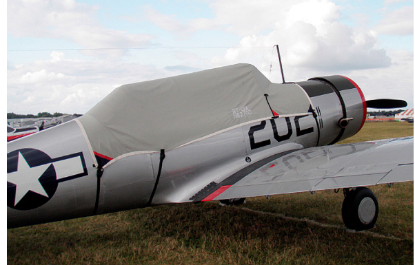
BT-13 Canopy Cover