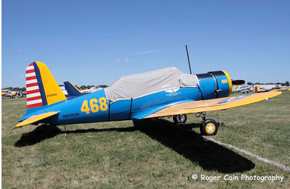
BT-13 Canopy Cover

This cover type is made from Silver Acrylic Sunbrella canvas and is 100% lined with a soft and smooth microfiber. Bruce's Custom Covers developed this material combination especially for aircraft protection. The outer material is medium weight and treated for water resistance, UV resistance and anti-static buildup. The inner lining is a very soft and smooth microfiber to prevent scratching. The material is very reflective, and tests show that the cabin interior temperature can be reduced to near-ambient temperature on the hottest of days. It is water, ice and snow repellent, yet breathable to allow moisture to escape from between the cover and the aircraft surface.