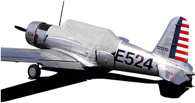
BT-13 Canopy Cover

non-travel Sunbrella Cover is the best choice.