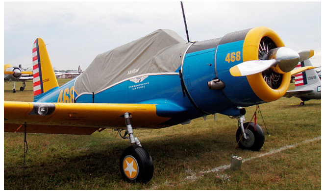
BT-13 Canopy Cover