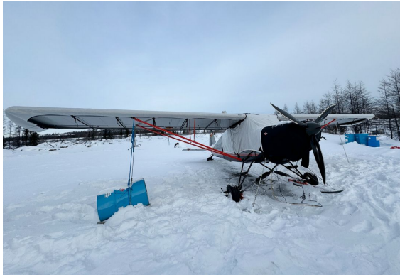
Bushmaster Wing, Canopy & Insulated Engine Covers

This cover type is made from Silver Acrylic Sunbrella canvas and is 100% lined with a soft and smooth microfiber. Bruce's Custom Covers developed this material combination especially for aircraft protection. The outer material is medium weight and treated for water resistance, UV resistance and anti-static buildup. The inner lining is a very soft and smooth microfiber to prevent scratching. The material is very reflective, and tests show that the cabin interior temperature can be reduced to near-ambient temperature on the hottest of days. It is water, ice and snow repellent, yet breathable to allow moisture to escape from between the cover and the aircraft surface.