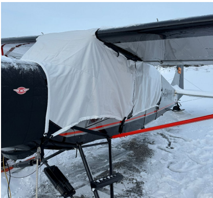
Bushmaster Canopy & Insulated Engine Covers