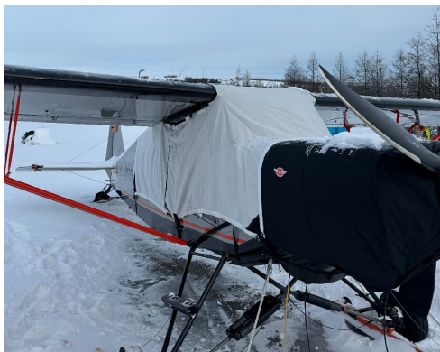
Bushmaster Canopy & Insulated Engine Covers

WINTER USE MATERIAL - Made with Solution-Dyed Polyester fabric, this option is intended for seasonal use to aid in deicing, rain mitigation, or for occasional travel. The material is lighter and more compact, but more susceptible to UV damage and may have a shorter useful life if used continuously outside than the all-year use material.