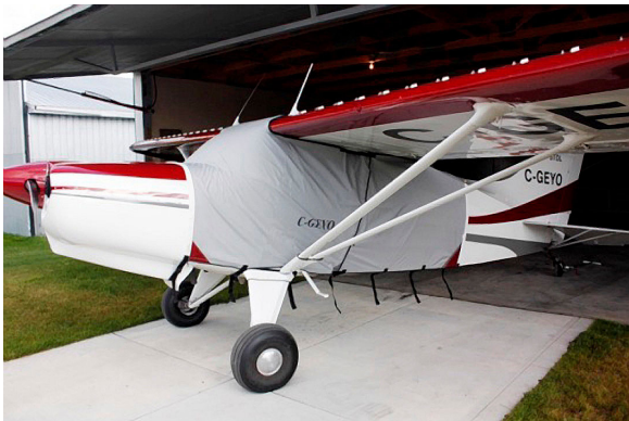
Maule Over-Top Extended Canopy Cover

This cover type is made from Silver Acrylic Sunbrella canvas and is 100% lined with a soft and smooth microfiber. Bruce's Custom Covers developed this material combination especially for aircraft protection. The outer material is medium weight and treated for water resistance, UV resistance and anti-static buildup. The inner lining is a very soft and smooth microfiber to prevent scratching. The material is very reflective, and tests show that the cabin interior temperature can be reduced to near-ambient temperature on the hottest of days. It is water, ice and snow repellent, yet breathable to allow moisture to escape from between the cover and the aircraft surface.