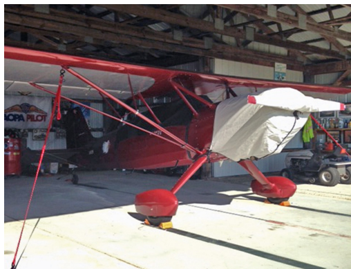
Bakeng Duce Engine & Prop Covers

The material is very reflective, and tests show that the cabin interior temperature can be reduced to near-ambient temperature on the hottest of days. It is water, ice and snow repellent, yet breathable to allow moisture to escape from between the cover and the aircraft surface.