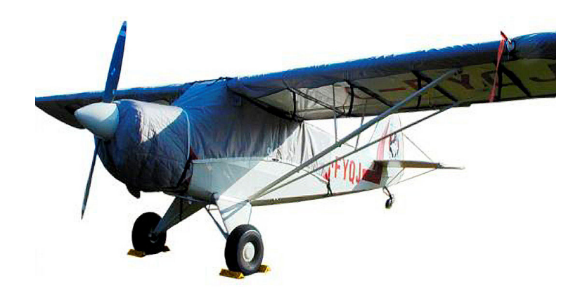
Aviat Husky Engine Plugs, Canopy, Wing & Empennage Covers Aviat Husky Insulated Engine Cover, Canopy & Wing Covers