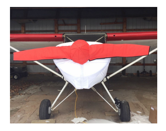
Bearhawk Engine Cover (test fit), Insulated Prop Cover