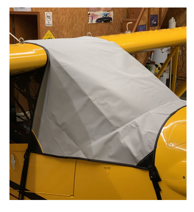
Cub Crafters Carbon Cub FX3 Windshield/Skylight Cover, travel weight