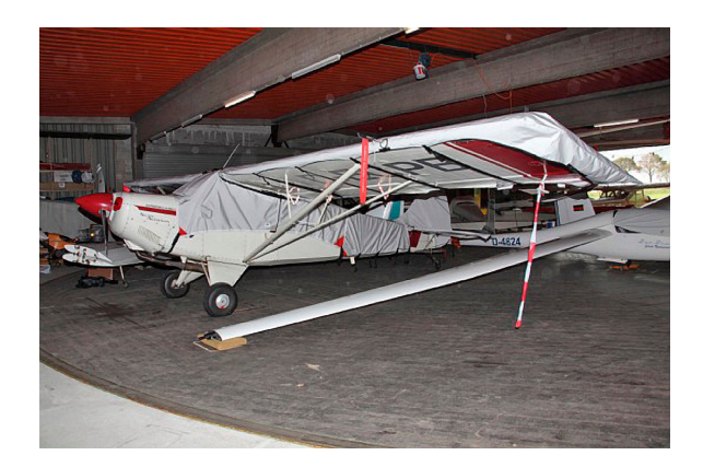
Aviat Husky Engine Plugs, Canopy, Wing & Empennage Covers

This cover type is made from Silver Acrylic Sunbrella canvas and is 100% lined with a soft and smooth microfiber. Bruce's Custom Covers developed this material combination especially for aircraft protection. The outer material is medium weight and treated for water resistance, UV resistance and anti-static buildup. The inner lining is a very soft and smooth microfiber to prevent scratching. The material is very reflective, and tests show that the cabin interior temperature can be reduced to near-ambient temperature on the hottest of days. It is water, ice and snow repellent, yet breathable to allow moisture to escape from between the cover and the aircraft surface.