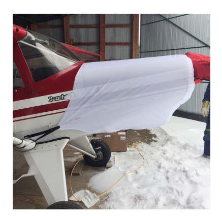
Bearhawk Engine Cover (test fit), Insulated Prop Cover

This cover type is made from Silver Acrylic Sunbrella canvas and is 100% lined with a soft and smooth microfiber. Bruce's Custom Covers developed this material combination especially for aircraft protection. The outer material is medium weight and treated for water resistance, UV resistance and anti-static buildup. The inner lining is a very soft and smooth microfiber to prevent scratching. The material is very reflective, and tests show that the cabin interior temperature can be reduced to near-ambient temperature on the hottest of days. It is water, ice and snow repellent, yet breathable to allow moisture to escape from between the cover and the aircraft surface.