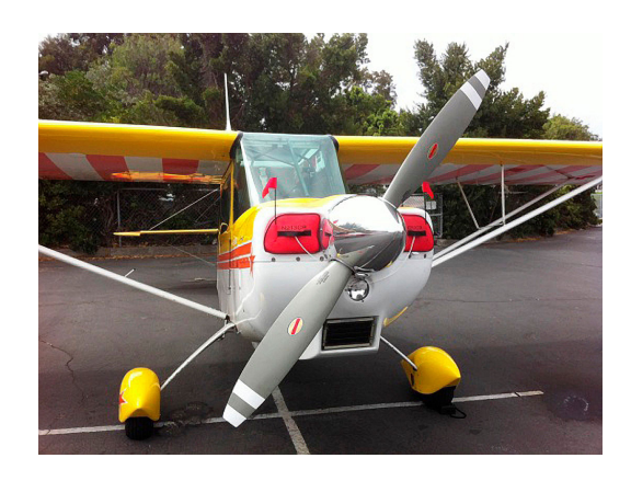
Bellanca Citabria Engine Plugs