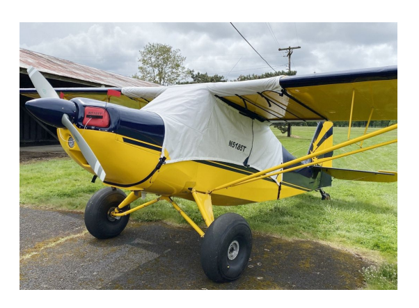
American Champion Citabria canopy cover over the top style, extends to cover gas caps, Engine Plugs