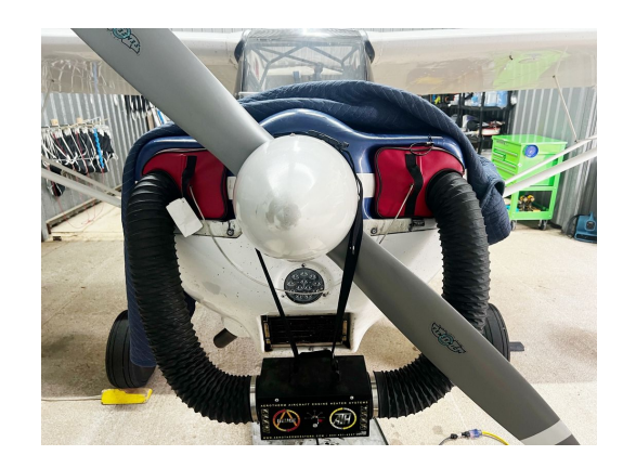
Citabria Engine Inlet Plugs with Aerotherm heater hose cutouts.