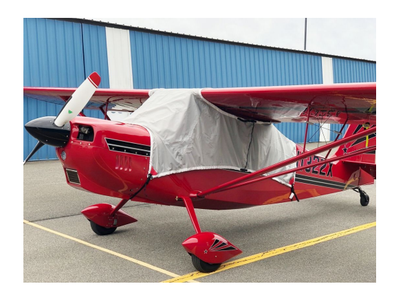
Bellanca Decathlon Travel Canopy Cover

This cover type is made from Silver Acrylic Sunbrella canvas and is 100% lined with a soft and smooth microfiber. Bruce's Custom Covers developed this material combination especially for aircraft protection. The outer material is medium weight and treated for water resistance, UV resistance and anti-static buildup. The inner lining is a very soft and smooth microfiber to prevent scratching. The material is very reflective, and tests show that the cabin interior temperature can be reduced to near-ambient temperature on the hottest of days. It is water, ice and snow repellent, yet breathable to allow moisture to escape from between the cover and the aircraft surface.