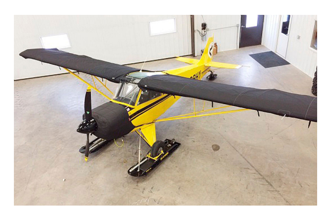
Aviat Husky Insulated Engine Cover, Wing Covers