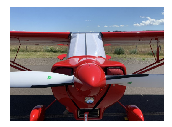
Bellanca Decathlon 8KCAB Heatshield Set with white side out

Windshield Heatshields are interior sunshades for an aircraft's front windshield. The product is a unique composite of closed-cell foam with a silver mylar finish. The semi-rigid design is stiff enough to stand along the inside of the windshield using sun visors or window framing. It folds up flat and easily stores in the included storage sleeve. Some designs may require velcro and suction cups or split right and left sides. A Heatshield is an excellent short-term remedy for cockpit overheating. An external fabric cover is far more effective and practical for long-term protection.