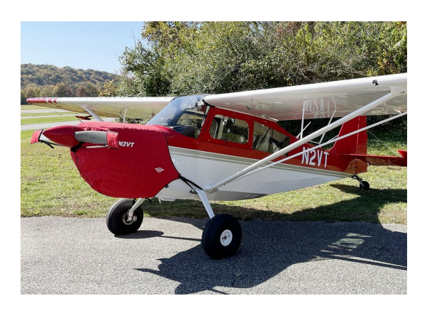
American Champion 7GCBC Insulated Engine Cover

This cover type is made from Silver Acrylic Sunbrella canvas and is 100% lined with a soft and smooth microfiber. Bruce's Custom Covers developed this material combination especially for aircraft protection. The outer material is medium weight and treated for water resistance, UV resistance and anti-static buildup. The inner lining is a very soft and smooth microfiber to prevent scratching. The material is very reflective, and tests show that the cabin interior temperature can be reduced to near-ambient temperature on the hottest of days. It is water, ice and snow repellent, yet breathable to allow moisture to escape from between the cover and the aircraft surface.