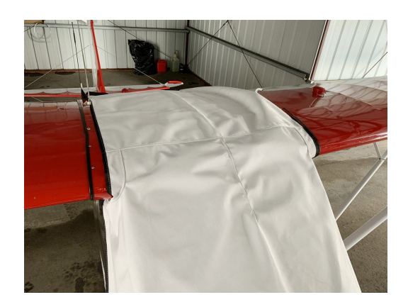
Bellanca Citabria Windshield/Skylight Cover