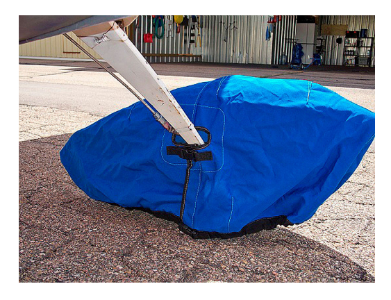
Bellanca Citabria Wheelpant Cover