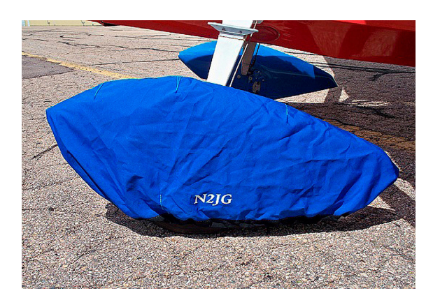
Bellanca Citabria Wheelpant Cover