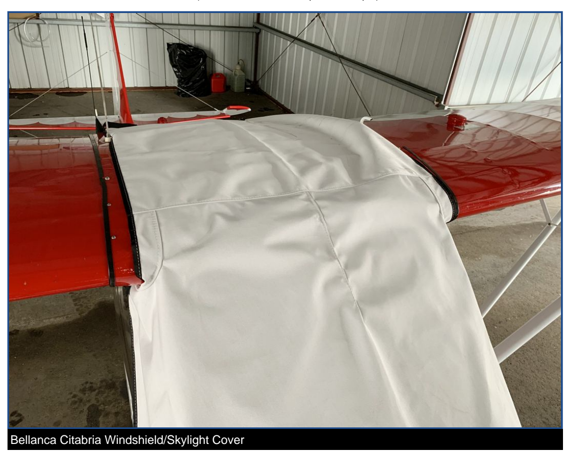
Section 1: Canopy/Cockpit/Fuselage Covers

Canopy Covers help reduce damage to your airplane's upholstery and avionics caused by excessive heat, and they can eliminate problems caused by leaking door and window seals. They keep the windshield and window surfaces clean and help prevent vandalism and theft.