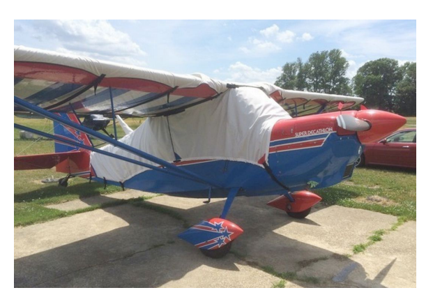
Bellanca Decathlon Canopy Cover (Over-Top, Extended to tail), Wing Covers, Engine Plugs