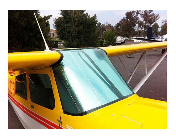
Bellanca Citabria Windshield HeatShield