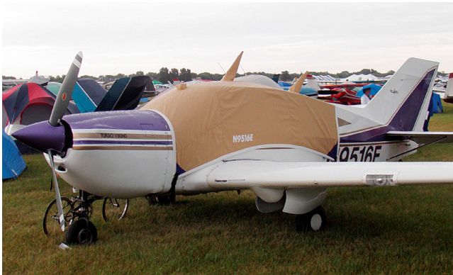
Bellanca Viking Canopy Cover