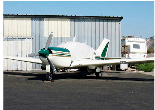
Bellanca Viking Canopy Cover