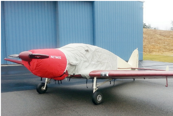
Bellanca Cruisemaster Insulated Engine Cover, Extended Canopy Cover

This cover type is made from Silver Acrylic Sunbrella canvas and is 100% lined with a soft and smooth microfiber. Bruce's Custom Covers developed this material combination especially for aircraft protection. The outer material is medium weight and treated for water resistance, UV resistance and anti-static buildup. The inner lining is a very soft and smooth microfiber to prevent scratching. The material is very reflective, and tests show that the cabin interior temperature can be reduced to near-ambient temperature on the hottest of days. It is water, ice and snow repellent, yet breathable to allow moisture to escape from between the cover and the aircraft surface.