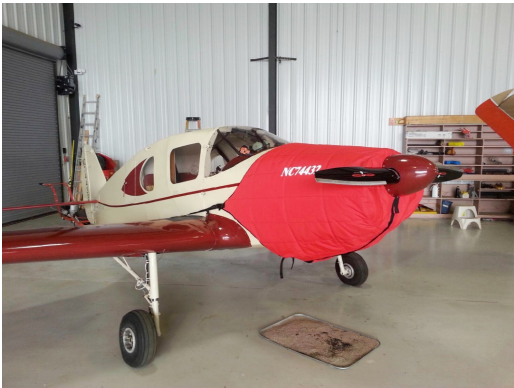
Bellanca Cruisemaster Insulated Engine Cover