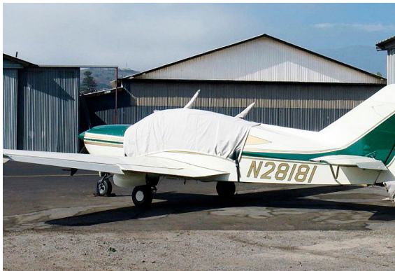
Bellanca Viking Canopy Cover

Travel Covers are made with Silver Solution-Dyed Polyester fabric and only lined over the windshield to save weight. The material is lightweight and more compact for easy stowage in the aircraft. The polyester material is water resistant, but only intended for occasional use outside. We also have an ultra lightweight material available for fitted hangar dust covers. For daily outdoor use, the non-travel Sunbrella Cover is the best choice.