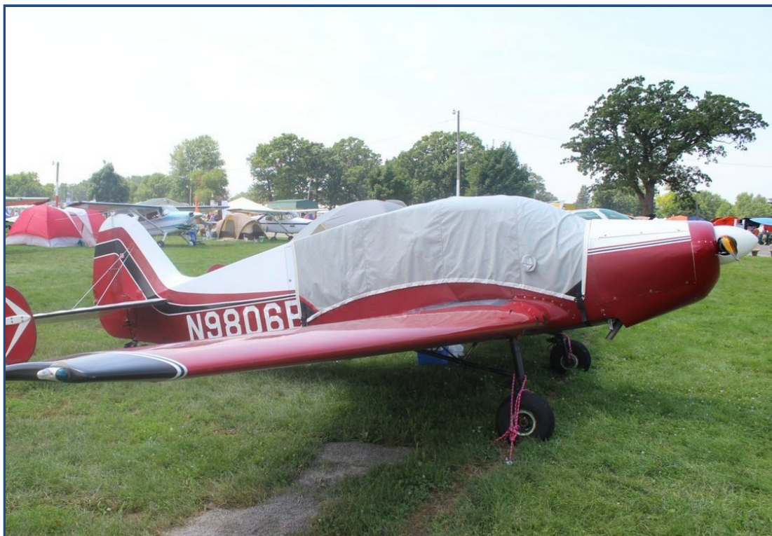
Bellanca Cruisemaster Canopy Cover