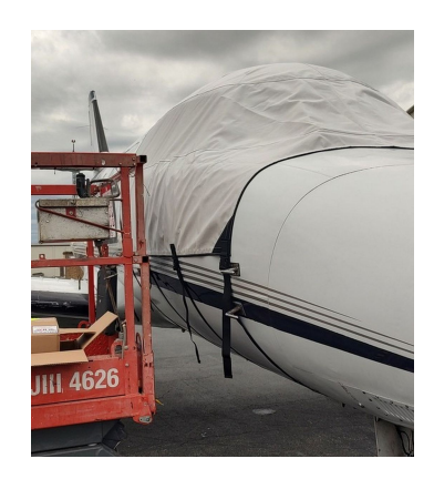
British Aerospace Jetstream 31 Cockpit Cover

This cover type is made from Silver Acrylic Sunbrella canvas and is 100% lined with a soft and smooth microfiber. Bruce's Custom Covers developed this material combination especially for aircraft protection. The outer material is medium weight and treated for water resistance, UV resistance and anti-static buildup. The inner lining is a very soft and smooth microfiber to prevent scratching. The material is very reflective, and tests show that the cabin interior temperature can be reduced to near-ambient temperature on the hottest of days. It is water, ice and snow repellent, yet breathable to allow moisture to escape from between the cover and the aircraft surface.