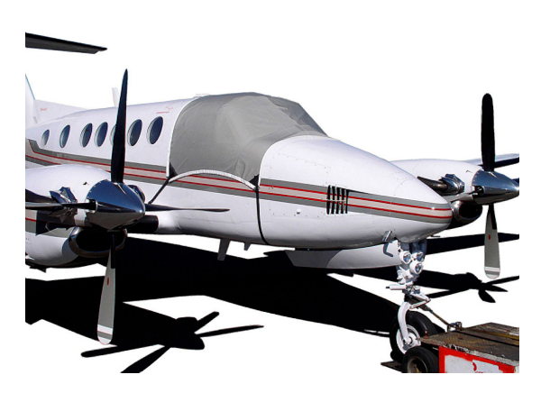
King Air 200/300 Snap-On Windshield Cover