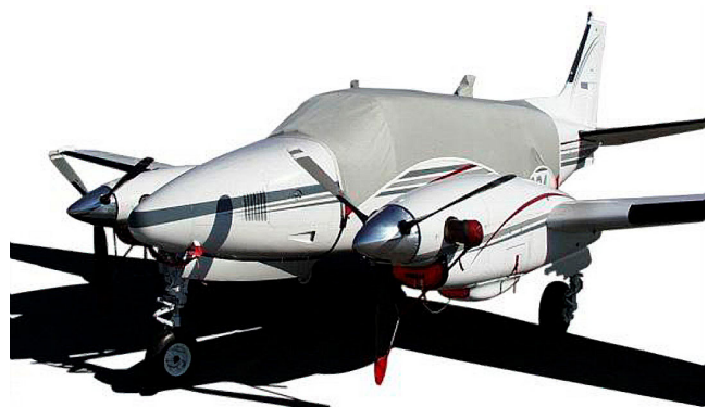
King Air Canopy Cover, Engine Plugs, Prop-Tie/Exhaust Covers