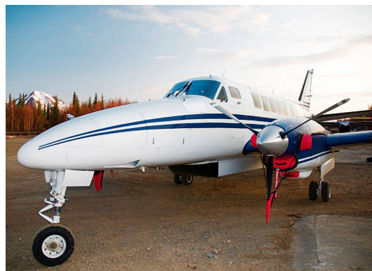
Beech 99 Engine Plugs & Prop Ties