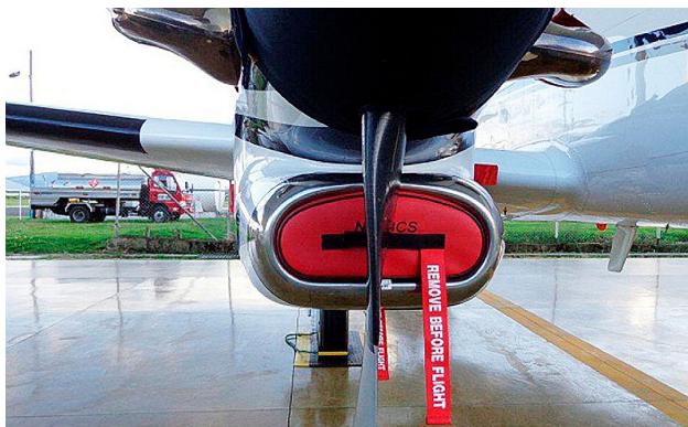
Beech King Air C90B Main Engine Inlet Plug

Engine Inlet Plugs are custom fit for your Beech 99 Airliner intakes, made with heavy-duty vinyl material, and stuffed with a single block of sculpted urethane foam. Each plug has a zipper that allows the foam to be removed and dried if necessary. Engine plugs have warning flags that are visible from the cockpit or 'remove before flight' streamers sewn onto the face of the plugs. Most plugs are imprinted with the aircraft registration number in black for an extra charge. Storage bag NOT included. Engine plugs may be inserted after flight when the engine is still warm. Engine Inlet Plugs are commonly referred to as Cowl Plugs, Intake Plugs, Cowl Blocks, Engine Blocks, and Engine Bungs.