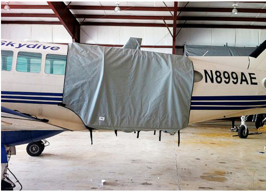
750XL Jump Door Cover