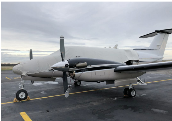
King Air 200 Canopy/Nose Cover

This cover type is made from Silver Acrylic Sunbrella canvas and is 100% lined with a soft and smooth microfiber. Bruce's Custom Covers developed this material combination especially for aircraft protection. The outer material is medium weight and treated for water resistance, UV resistance and anti-static buildup. The inner lining is a very soft and smooth microfiber to prevent scratching. The material is very reflective, and tests show that the cabin interior temperature can be reduced to near-ambient temperature on the hottest of days. It is water, ice and snow repellent, yet breathable to allow moisture to escape from between the cover and the aircraft surface.