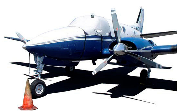
King Air Cockpit Cover, belly-strap type

Travel Covers are made with Silver Solution-Dyed Polyester fabric and only lined over the windshield to save weight. The material is lightweight and more compact for easy stowage in the aircraft. The polyester material is water resistant, but only intended for occasional use outside. We also have an ultra lightweight material available for fitted hangar dust covers. For daily outdoor use, the non-travel Sunbrella Cover is the best choice.