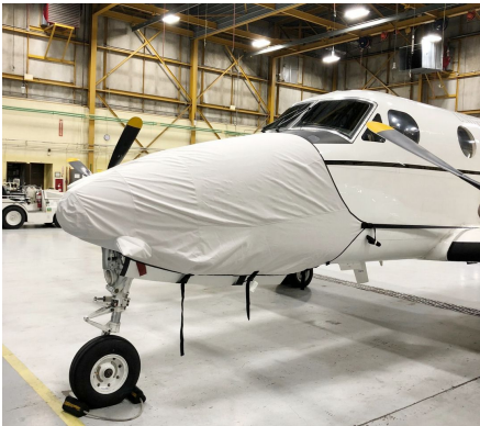
King Air 200 Nose Cover