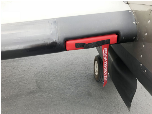
Beech King Air Heat Exchanger Inlet Plug