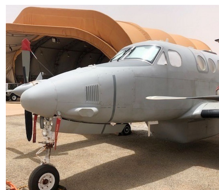
Beech King Air Cockpit HeatShields