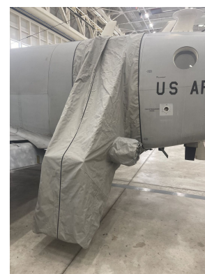
King Air Airstair Door Cover