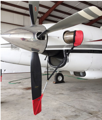
Beech King Air C90 Prop Tie/Exhaust Cover Set

This cover type is made from Silver Acrylic Sunbrella canvas and is 100% lined with a soft and smooth microfiber. Bruce's Custom Covers developed this material combination especially for aircraft protection. The outer material is medium weight and treated for water resistance, UV resistance and anti-static buildup. The inner lining is a very soft and smooth microfiber to prevent scratching. The material is very reflective, and tests show that the cabin interior temperature can be reduced to near-ambient temperature on the hottest of days. It is water, ice and snow repellent, yet breathable to allow moisture to escape from between the cover and the aircraft surface.