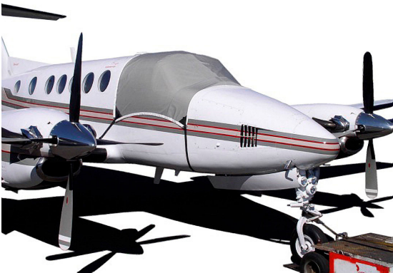
King Air 200/300 Snap-On Windshield Cover

This cover type is made from Silver Acrylic Sunbrella canvas and is 100% lined with a soft and smooth microfiber. Bruce's Custom Covers developed this material combination especially for aircraft protection. The outer material is medium weight and treated for water resistance, UV resistance and anti-static buildup. The inner lining is a very soft and smooth microfiber to prevent scratching. The material is very reflective, and tests show that the cabin interior temperature can be reduced to near-ambient temperature on the hottest of days. It is water, ice and snow repellent, yet breathable to allow moisture to escape from between the cover and the aircraft surface.