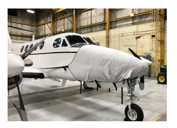
King Air 200 Nose Cover