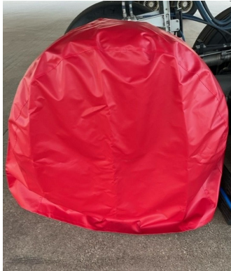
Boeing 777 Main Gear Tire Covers

ALL-YEAR USE MATERIAL - Made with Silver Acrylic Sunbrella canvas, the all-year use material is the best option for sun protection and cover longevity. This heavier more durable material is intended for all weather conditions, such as rain and snow or lots of sun.