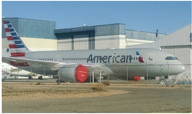
Boeing 787 Intake Covers