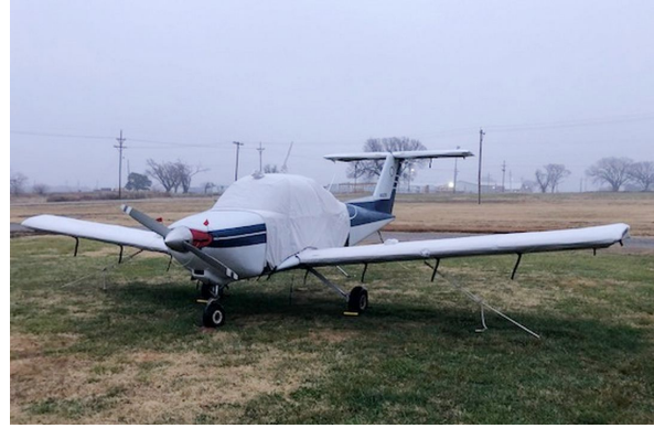
Beech Skipper Extended Canopy Cover, Wing & Horiz. Stab. Covers