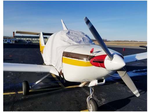
Beech Skipper Extended Canopy Cover and Inlet Plugs