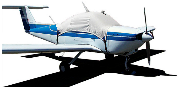
Canopy Cover for Beech Skipper