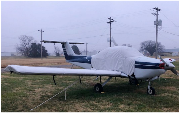
Beech Skipper Extended Canopy Cover, Wing & Horiz. Stab. Covers

This cover type is made from Silver Acrylic Sunbrella canvas and is 100% lined with a soft and smooth microfiber. Bruce's Custom Covers developed this material combination especially for aircraft protection. The outer material is medium weight and treated for water resistance, UV resistance and anti-static buildup. The inner lining is a very soft and smooth microfiber to prevent scratching. The material is very reflective, and tests show that the cabin interior temperature can be reduced to near-ambient temperature on the hottest of days. It is water, ice and snow repellent, yet breathable to allow moisture to escape from between the cover and the aircraft surface.