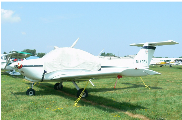
Beech Skipper Canopy Cover, Engine Plugs

Travel Covers are made with Silver Solution-Dyed Polyester fabric and only lined over the windshield to save weight. The material is lightweight and more compact for easy stowage in the aircraft. The polyester material is water resistant, but only intended for occasional use outside. We also have an ultra lightweight material available for fitted hangar dust covers. For daily outdoor use, the non-travel Sunbrella Cover is the best choice.