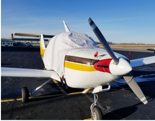
Beech Skipper Extended Canopy Cover and Inlet Plugs

plugs are imprinted with the aircraft registration number in black for an extra charge. Storage bag NOT included. Engine plugs may be inserted after flight when the engine is still warm. Engine Inlet Plugs are commonly referred to as Cowl Plugs, Intake Plugs, Cowl Blocks, Engine Blocks, and Engine Bungs.