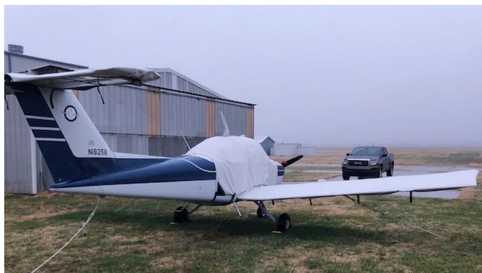
Beech Skipper Extended Canopy Cover, Wing & Horiz. Stab. Covers