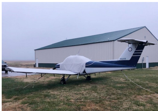
Beech Skipper Extended Canopy Cover, Wing & Horiz. Stab. Covers

WINTER USE MATERIAL - Made with Solution-Dyed Polyester fabric, this option is intended for seasonal use to aid in deicing, rain mitigation, or for occasional travel. The material is lighter and more compact, but more susceptible to UV damage and may have a shorter useful life if used continuously outside than the all-year use material.