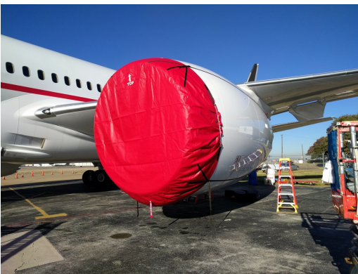
Boeing 787 Intake Cover

FABRIC & THREAD: For strength, durability and ease of use we make these covers of the heaviest nylon ballistic cloth. It is sewn in multiple courses with Tenara thread, and reinforced with heavy vinyl cloth at high-wear points.