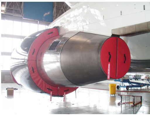
Exhaust Plugs Ship Set, incl. Fan Thrust Reverser and Exhaust Plugs P/N: B767-200