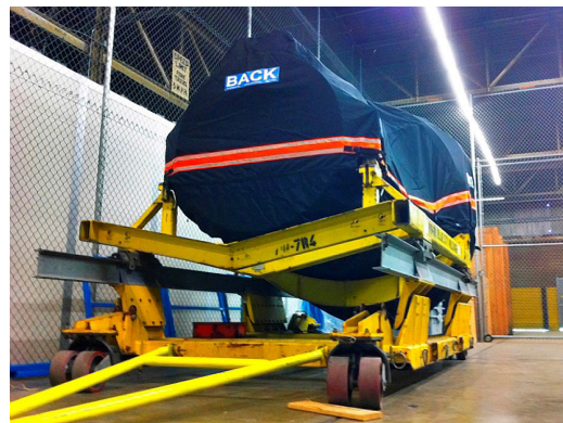
PW JT9D Series Off-Link Engine Transport Cover, Fully Enclosed, P/N: PW-120