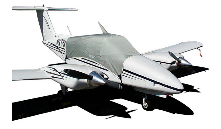
Duchess Standard Canopy Cover

This cover type is made from Silver Acrylic Sunbrella canvas and is 100% lined with a soft and smooth microfiber. Bruce's Custom Covers developed this material combination especially for aircraft protection. The outer material is medium weight and treated for water resistance, UV resistance and anti-static buildup. The inner lining is a very soft and smooth microfiber to prevent scratching. The material is very reflective, and tests show that the cabin interior temperature can be reduced to near-ambient temperature on the hottest of days. It is water, ice and snow repellent, yet breathable to allow moisture to escape from between the cover and the aircraft surface.