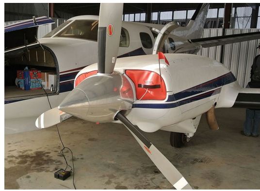
Beech Duke Engine Inlet Plugs