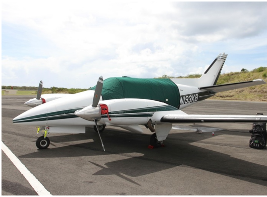
Beech Duke Canopy Cover, Engine Plugs