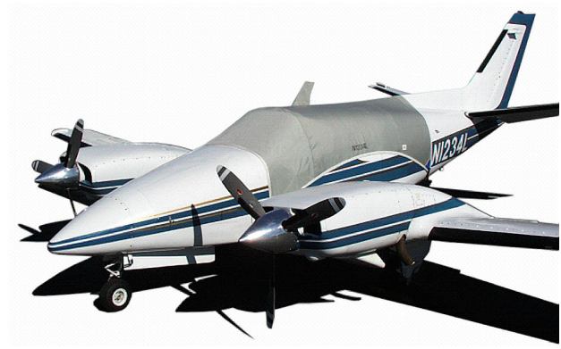
Beech Duke Standard Canopy Cover