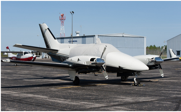
Beech Duke Canopy Cover