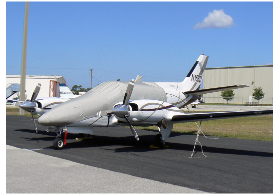
Beech Duke Canopy/Nose Cover