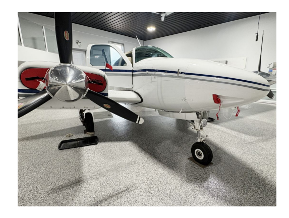
Beech Baron 55, A55, B55 & C55 Engine Inlet Plugs