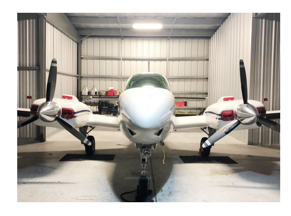
Beech Baron Engine Plugs