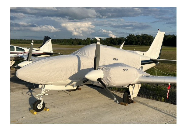
Beech Baron 58, G58 Canopy Cover, Insulated Engine Covers Beech C55 Baron Extended Canopy/Nose Cover, Engine Covers