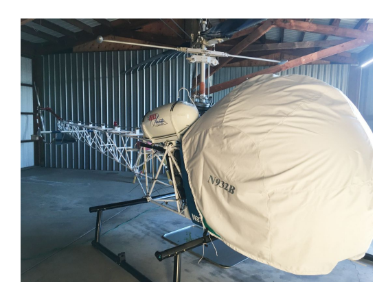
Bell 47 Bubble Cover