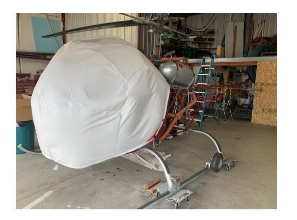
Bell 47 Bubble Cover, Narrow Cabin