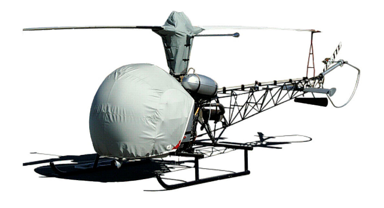
Bubble and Main Rotor Mast Covers