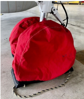
Beech King Air 300 Tire Covers (main gear)

ALL-YEAR USE MATERIAL - Made with Silver Acrylic Sunbrella canvas, the all-year use material is the best option for sun protection and cover longevity. This heavier more durable material is intended for all weather conditions, such as rain and snow or lots of sun.