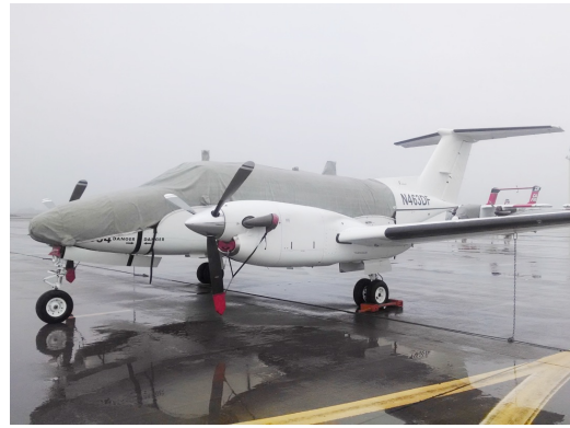
King Air 200 Canopy/Nose Cover, Engine Plugs & Prop Ties