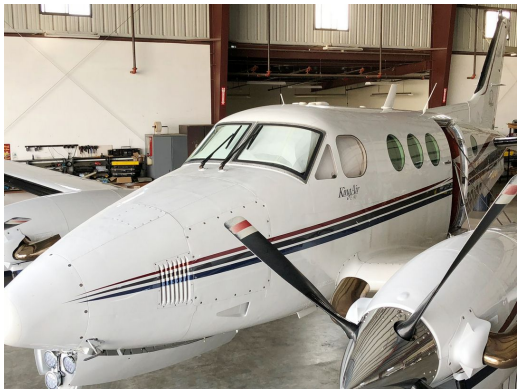
Beech King Air 90 & 100 (U-21, RU-21, T-44) Cockpit Heatshields

Cockpit Heatshields are interior sunshades for the aircraft's cockpit. The product is a unique composite of closed-cell foam with a silver mylar finish. The semi-rigid design is stiff enough to stand inside the window framing. The set folds up flat and is easily stored in the included storage sleeve. Some designs may require velcro and suction cups. A Heatshield is an excellent short-term remedy for cockpit overheating, but an external fabric cover is more effective for long-term protection.