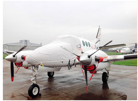
King Air 300 Canopy Cover, Engine Plugs, Prop Tie/Exhaust Covers King Air Cockpit/Nose Cover, Plugs, Prop Tie/Exhaust Covers