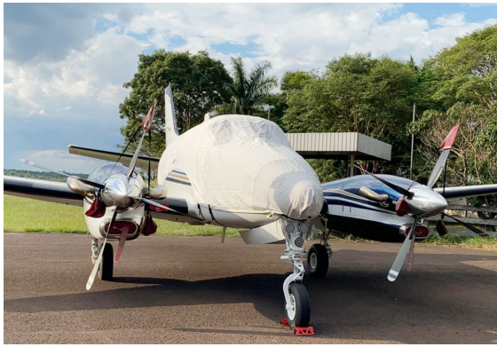
King Air C90GTi Canopy/Nose Cover