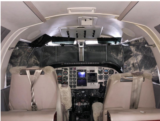
Beech King Air 90 & 100 (U-21, RU-21, T-44) Cockpit Heatshields