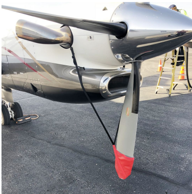
Beech King Air 350 Prop Tie-Downs