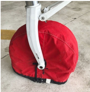
Beech King Air 300 Tire Covers (nose gear)