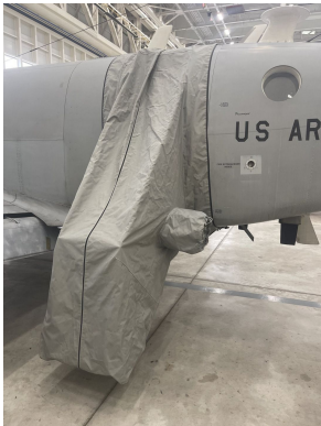
King Air Airstair Door Cover