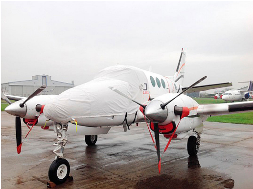
King Air Cockpit/Nose Cover, Plugs, Prop Tie/Exhaust Covers