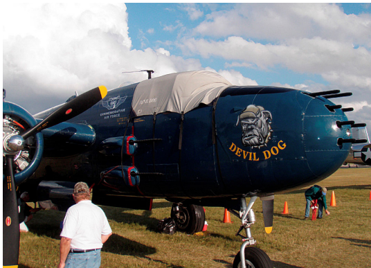
Mitchell B25 Cockpit Cover w/ Custom Imprint (Bellystrap Type)

Engine Inlet Plugs are custom fit for your North American Mitchell B25 intakes, made with heavy-duty vinyl material, and stuffed with a single block of sculpted urethane foam. Each plug has a zipper that allows the foam to be removed and dried if necessary. Engine plugs have warning flags that are visible from the cockpit or 'remove before flight' streamers sewn onto the face of the plugs. Most plugs are imprinted with the aircraft registration number in black for an extra charge. Storage bag NOT included. Engine plugs may be inserted after flight when the engine is still warm. Engine Inlet Plugs are commonly referred to as Cowl Plugs, Intake Plugs, Cowl Blocks, Engine Blocks, and Engine Bunges.