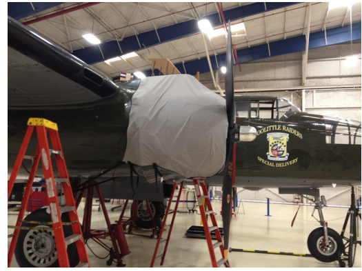
B25 Engine Cover