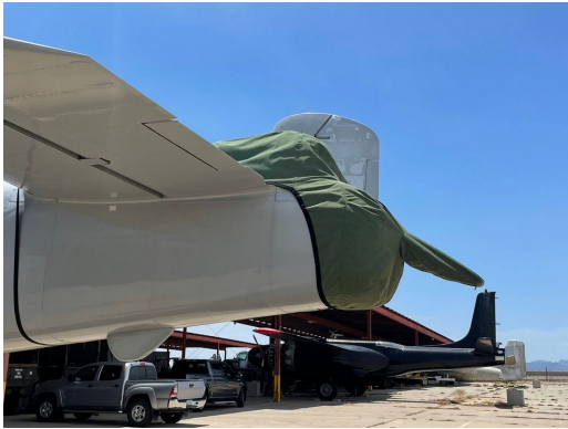
Mitchell B25 Tail Gunner Cover