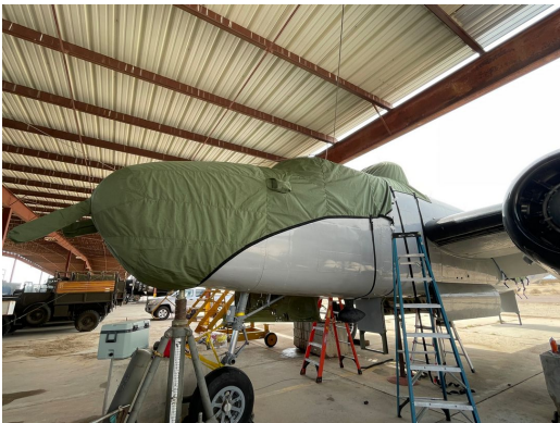
Mitchell B25 Cockpit/Nose Cover, & Turret Cover