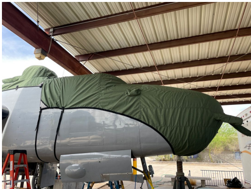
Mitchell B25 Cockpit/Nose Cover, & Turret Cover

This cover type is made from Silver Acrylic Sunbrella canvas and is 100% lined with a soft and smooth microfiber. Bruce's Custom Covers developed this material combination especially for aircraft protection. The outer material is medium weight and treated for water resistance, UV resistance and anti-static buildup. The inner lining is a very soft and smooth microfiber to prevent scratching. The material is very reflective, and tests show that the cabin interior temperature can be reduced to near-ambient temperature on the hottest of days. It is water, ice and snow repellent, yet breathable to allow moisture to escape from between the cover and the aircraft surface.