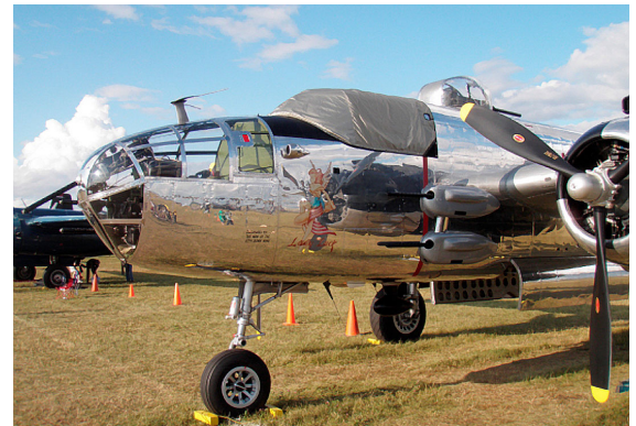
Mitchell B25 Cockpit Cover (Snap-On Type)