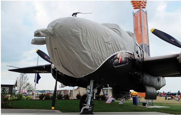
B25 Cockpit/Nose and Gun Turret Covers