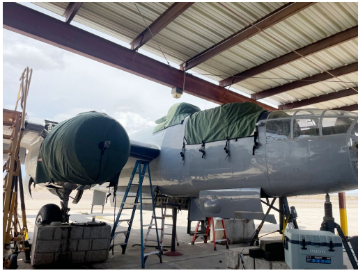
Mitchell B25 Cockpit, Turret & Engine Covers