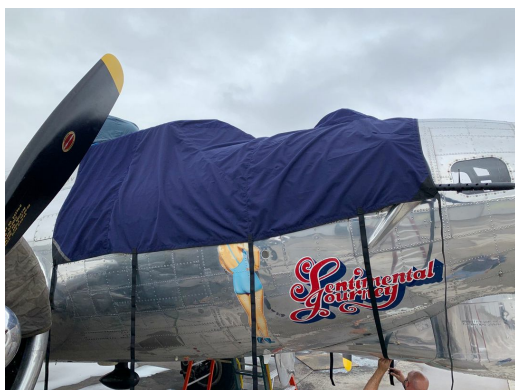
Boeing B-17 Canopy Cover