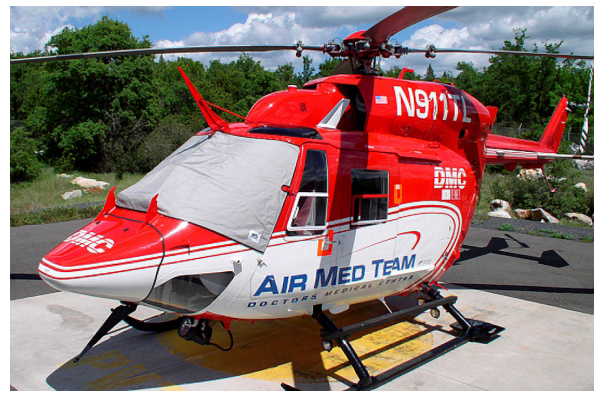
BK-117 Windshield Cover