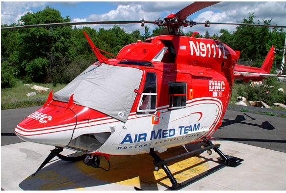
BK-117 Windshield Cover