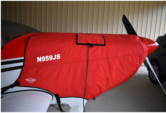
Van's RV-6 Insulated Engine Cover