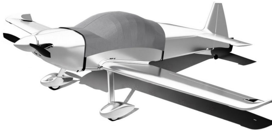
Aura Integral R Canopy Cover, 3D model

Travel Covers are made with Silver Solution-Dyed Polyester fabric and only lined over the windshield to save weight. The material is lightweight and more compact for easy stowage in the aircraft. The polyester material is water resistant, but only intended for occasional use outside. We also have an ultra lightweight material available for fitted hangar dust covers. For daily outdoor use, the non-travel Sunbrella Cover is the best choice.