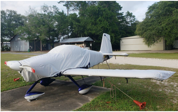
Van's RV-7A Cover Set