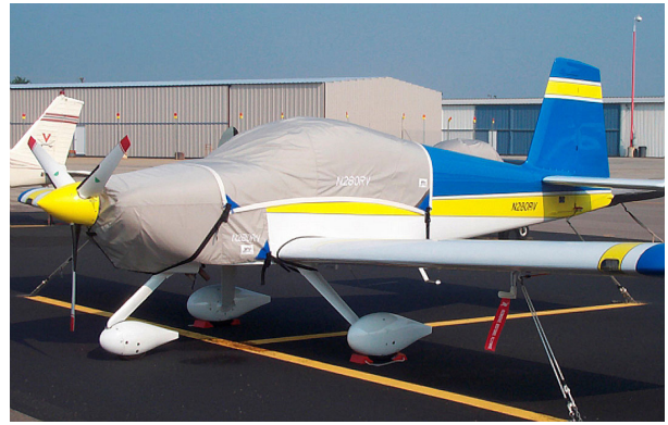
Van's RV-9 Canopy & Engine Covers