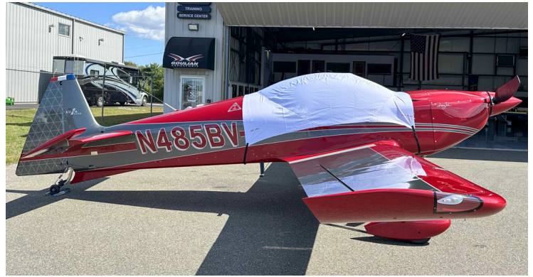
Aura Aero Integral R Canopy Cover, test fit cover