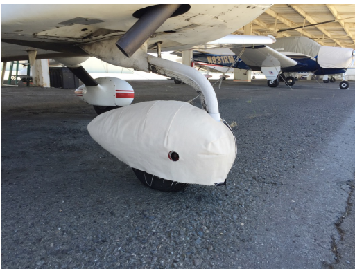
Grumman AA5 Nose Wheelpant Cover, test fit

ALL-YEAR USE MATERIAL - Made with Silver Acrylic Sunbrella canvas, the all-year use material is the best option for sun protection and cover longevity. This heavier more durable material is intended for all weather conditions, such as rain and snow or lots of sun.