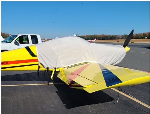
Van's RV-6A Extended Canopy/Engine Cover