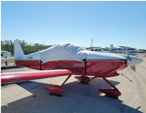
Van's RV-6A Canopy Cover

This cover type is made from Silver Acrylic Sunbrella canvas and is 100% lined with a soft and smooth microfiber. Bruce's Custom Covers developed this material combination especially for aircraft protection. The outer material is medium weight and treated for water resistance, UV resistance and anti-static buildup. The inner lining is a very soft and smooth microfiber to prevent scratching. The material is very reflective, and tests show that the cabin interior temperature can be reduced to near-ambient temperature on the hottest of days. It is water, ice and snow repellent, yet breathable to allow moisture to escape from between the cover and the aircraft surface.