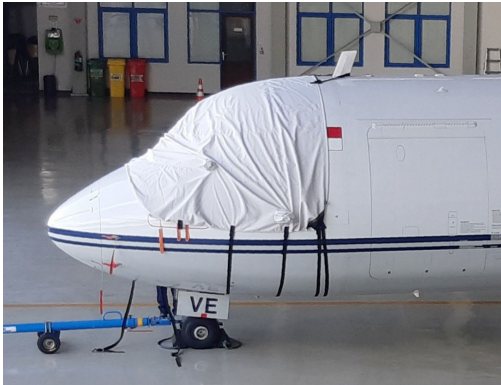
ATR-42 Cockpit Cover