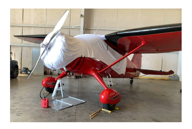
Stinson Reliant Over-Top Canopy/Engine Cover