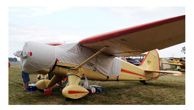
Stinson Reliant Over-the-top Canopy, Engine & Propellor Covers