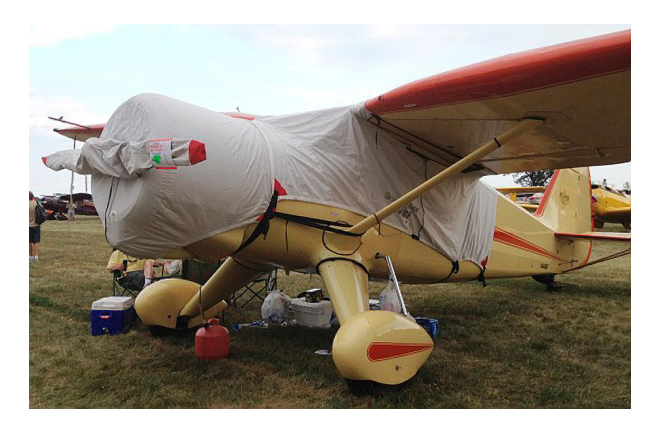
Stinson Reliant Over-the-top Canopy, Engine, and Propeller Cover