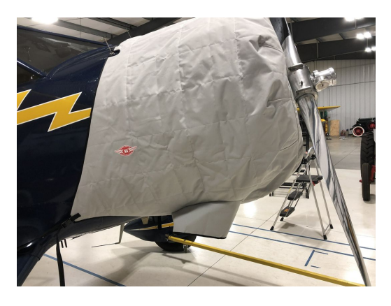
Stinson Reliant SR-10 Insulated Engine Cover