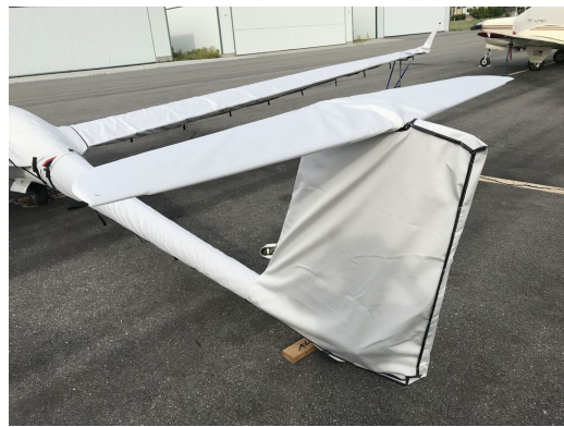
Schleicher ASW-27b Empennage & Wing Covers