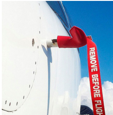
Westwind 1125 Astra Pitot Cover, Heat Resistant Type

The Engine Inlet Plugs are custom fit for your Israel Aircraft Industries Astra (C-38) intakes, made with heavy-duty vinyl material, and stuffed with a single block of sculpted urethane foam. Each plug has a zipper that allows the foam to be removed and dried if necessary. Engine plugs have 'remove before flight' streamers sewn onto the face of the plugs. Most plugs are imprinted with the aircraft registration number in black for an extra charge. Storage bag NOT included. Engine plugs may be inserted after flight when the engine is still warm. Engine Inlet Plugs are commonly referred to as Cowl Plugs, Intake Plugs, Cowl Blocks, Engine Blocks, and Engine Bungs.