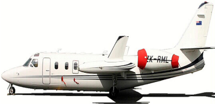
Engine Cover Set for the Astra