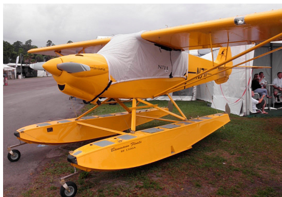
Cub Crafters Carbon Cub Canopy Cover

Travel Covers are made with Silver Solution-Dyed Polyester fabric and only lined over the windshield to save weight. The material is lightweight and more compact for easy stowage in the aircraft. The polyester material is water resistant, but only intended for occasional use outside. We also have an ultra lightweight material available for fitted hangar dust covers. For daily outdoor use, the non-travel Sunbrella Cover is the best choice.