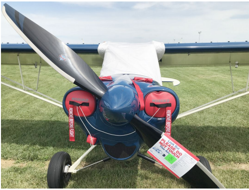
Cub Crafters EX2 Canopy Cover, Engine Plugs