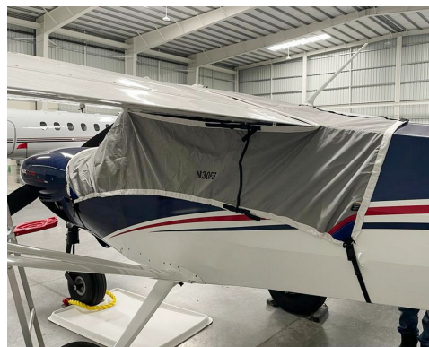
CubCrafters CCX-2300 Light Weight Travel Cover