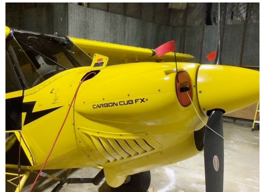
Cub Crafters CCX-2000 Engine Plugs