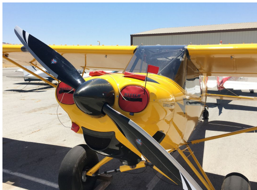
Cub Crafters CC-11 Carbon Cub Engine Plugs

Engine Inlet Plugs are custom fit for your Lewaero Ascender intakes, made with heavy-duty vinyl material, and stuffed with a single block of sculpted urethane foam. Each plug has a zipper that allows the foam to be removed and dried if necessary. Engine plugs have warning flags that are visible from the cockpit or 'remove before flight' streamers sewn onto the face of the plugs. Most plugs are imprinted with the aircraft registration number in black for an extra charge. Storage bag NOT included. Engine plugs may be inserted after flight when the engine is still warm. Engine Inlet Plugs are commonly referred to as Cowl Plugs, Intake Plugs, Cowl Blocks, Engine Blocks, and Engine Bungs.