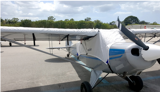
Aviat (Christen) Husky Canopy Cover (Over-The-Top Style)