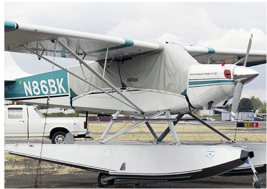
Aviat Husky Canopy Cover and Inlet Plugs