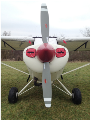
Aviat Husky Engine Plugs, Wing Covers

WINTER USE MATERIAL - Made with Solution-Dyed Polyester fabric, this option is intended for seasonal use to aid in deicing, rain mitigation, or for occasional travel. The material is lighter and more compact, but more susceptible to UV damage and may have a shorter useful life if used continuously outside than the all-year use material.