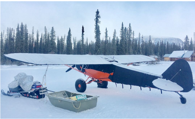
FOR INTERIOR USE. Cub Crafters CC-11 Insulated Hangar Blanket, available in Red or Silver Piper PA-18 Super Cub Canopy Cover (Over-The-Top Style)