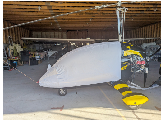
Magni M16 Autogyro Canopy/Nose Cover, test fit cover American Ranger AR-1 Gyrocopter Canopy/Nose Cover, enclosed cockpit