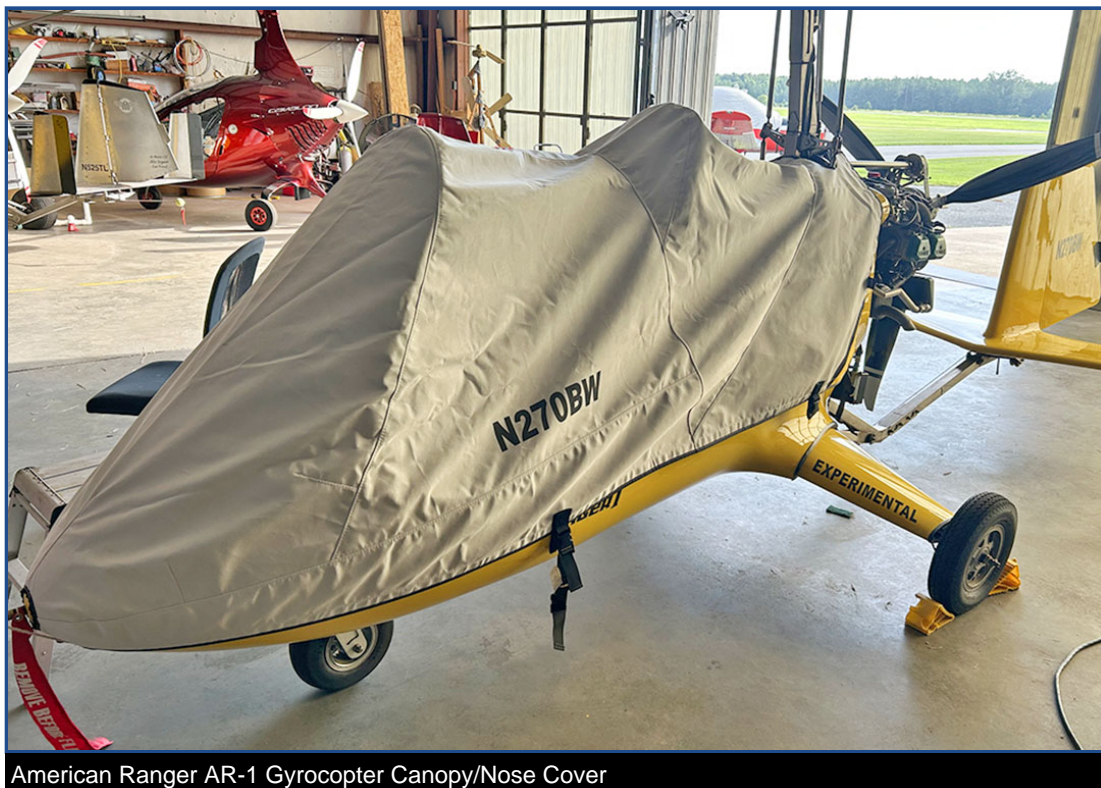
American Ranger AR-1 Gyrocopter Canopy/Nose Cover