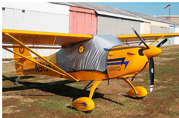
Aerotrek A220 Fitted Hangar Dust Cover

Travel Covers are made with Silver Solution-Dyed Polyester fabric and only lined over the windshield to save weight. The material is lightweight and more compact for easy stowage in the aircraft. The polyester material is water resistant, but only intended for occasional use outside. We also have an ultra lightweight material available for fitted hangar dust covers. For daily outdoor use, the non-travel Sunbrella Cover is the best choice.