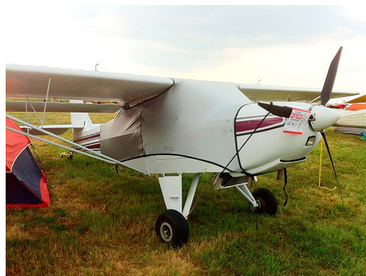
Kitfox Spandex FlyAway Travel Canopy Cover