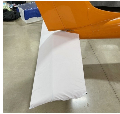
Aeromarine Merlin Horizontal Stabilizer Covers, test fit covers