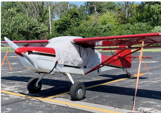
Kitfox Super Sport Canopy Cover