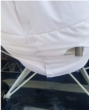
Kitfox Engine Cover, "Radial Cowl" type, test fit

This cover type is made from Silver Acrylic Sunbrella canvas and is 100% lined with a soft and smooth microfiber. Bruce's Custom Covers developed this material combination especially for aircraft protection. The outer material is medium weight and treated for water resistance, UV resistance and anti-static buildup. The inner lining is a very soft and smooth microfiber to prevent scratching. The material is very reflective, and tests show that the cabin interior temperature can be reduced to near-ambient temperature on the hottest of days. It is water, ice and snow repellent, yet breathable to allow moisture to escape from between the cover and the aircraft surface.