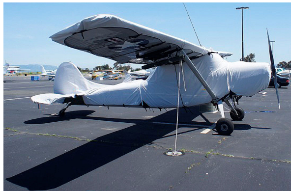
Wing Covers on Cessna Bird Dog

WINTER USE MATERIAL - Made with Solution-Dyed Polyester fabric, this option is intended for seasonal use to aid in deicing, rain mitigation, or for occasional travel. The material is lighter and more compact, but more susceptible to UV damage and may have a shorter useful life if used continuously outside than the all-year use material.