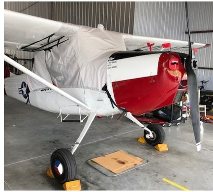
Cessna Bird Dog, L-19, O-1, 305 Canopy Cover, Over-Top Type