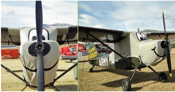
Cessna L-19 Bird Dog Canopy Cover, Engine Cover