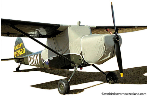
Cessna L-19 Canopy & Engine Covers

the hottest of days. It is water, ice and snow repellent, yet breathable to allow moisture to escape from between the cover and the aircraft surface.