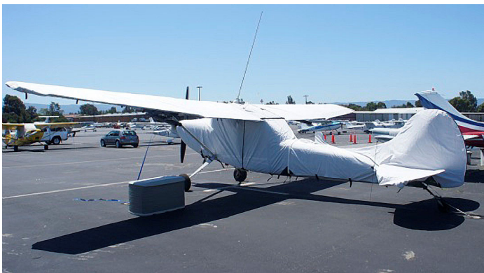
Cessna 182 Skylane 3-Blade Prop Cover Cessna L-19 Extended Over-the-top Canopy, Engine, Empennage & Wing Covers