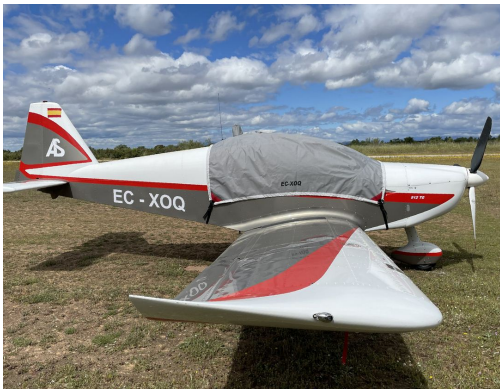
Direct Fly Alto Travel Cover, Light Weight Canopy Cover