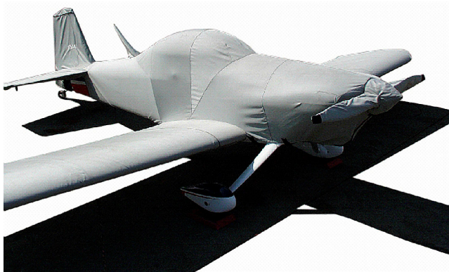
Van's RV-4 Complete Cover

This cover type is made from Silver Acrylic Sunbrella canvas and is 100% lined with a soft and smooth microfiber. Bruce's Custom Covers developed this material combination especially for aircraft protection. The outer material is medium weight and treated for water resistance, UV resistance and anti-static buildup. The inner lining is a very soft and smooth microfiber to prevent scratching. The material is very reflective, and tests show that the cabin interior temperature can be reduced to near-ambient temperature on the hottest of days. It is water, ice and snow repellent, yet breathable to allow moisture to escape from between the cover and the aircraft surface.