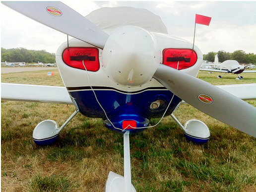
Van's RV-10 Canopy Cover & Engine Inlet Plugs