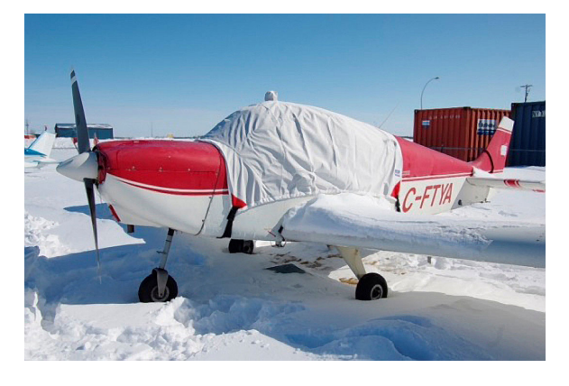
Alarus CH2000 Canopy Cover & Engine Plugs