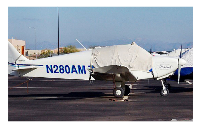
Alarus CH2000 Canopy Cover

This cover type is made from Silver Acrylic Sunbrella canvas and is 100% lined with a soft and smooth microfiber. Bruce's Custom Covers developed this material combination especially for aircraft protection. The outer material is medium weight and treated for water resistance, UV resistance and anti-static buildup. The inner lining is a very soft and smooth microfiber to prevent scratching. The material is very reflective, and tests show that the cabin interior temperature can be reduced to near-ambient temperature on the hottest of days. It is water, ice and snow repellent, yet breathable to allow moisture to escape from between the cover and the aircraft surface.