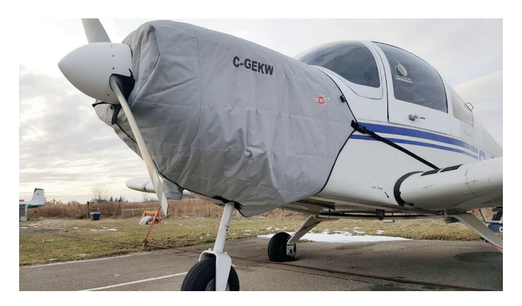
Alarus CH-2000 Insulated Engine Cover