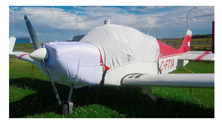
Alarus CH2000 Canopy Cover & Engine Cover (test fit)

This cover type is made from Silver Acrylic Sunbrella canvas and is 100% lined with a soft and smooth microfiber. Bruce's Custom Covers developed this material combination especially for aircraft protection. The outer material is medium weight and treated for water resistance, UV resistance and anti-static buildup. The inner lining is a very soft and smooth microfiber to prevent scratching. The material is very reflective, and tests show that the cabin interior temperature can be reduced to near-ambient temperature on the hottest of days. It is water, ice and snow repellent, yet breathable to allow moisture to escape from between the cover and the aircraft surface.