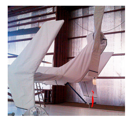
Tail Rotor Cover & Tailboom, Vertical Pylon & Stabilizers Cover

The Tailboom Cover details vary by model, but generally the helicopter tail boom cover encloses the tail boom from the "bottleneck" to the aft end. They usually also cover the horizontal stabilizers, and are custom made to allow for antennae, lights, and other protrusions. They attach with straps underneath the tail boom. Covers for the vertical and horizontal stabilizers are also available separately. Specific information for each model is available on request.