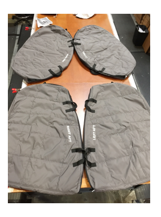
MD 500D Padded Door Bags