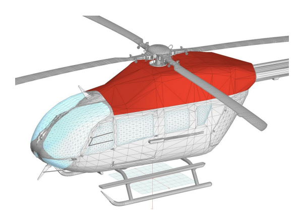
Intake/Exhaust Engine Area Cover, 3D Rendering