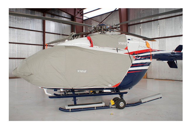
Bubble Cover w/ nose mounted radome, Upper Deck Plugs/Cover