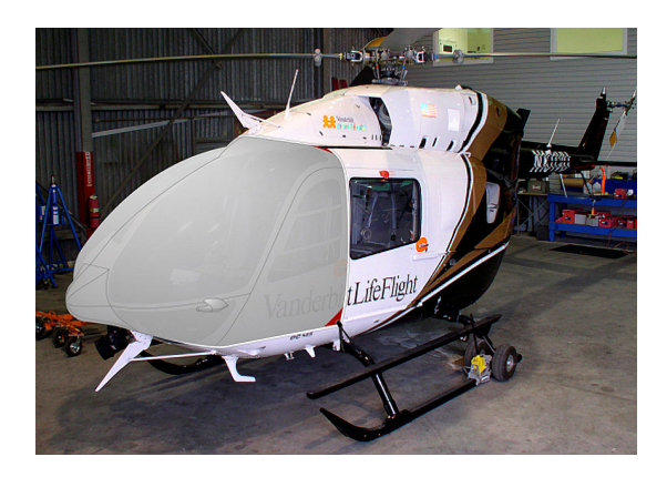
EC-145 Windshield/Nose Cover (illustration)

This cover type is made from Silver Acrylic Sunbrella canvas and is 100% lined with a soft and smooth microfiber. Bruce's Custom Covers developed this material combination especially for aircraft protection. The outer material is medium weight and treated for water resistance, UV resistance and anti-static buildup. The inner lining is a very soft and smooth microfiber to prevent scratching. The material is very reflective, and tests show that the cabin interior temperature can be reduced to near-ambient temperature on the hottest of days. It is water, ice and snow repellent, yet breathable to allow moisture to escape from between the cover and the aircraft surface.