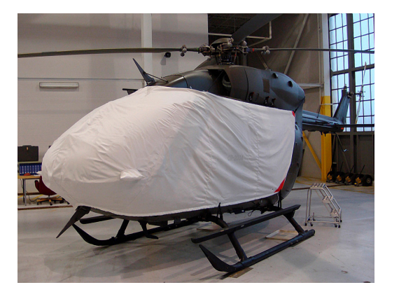
EC-145 Bubble Cover