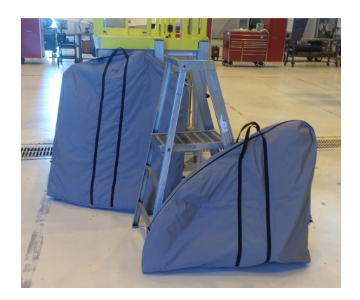
Eurocopter EC-145 Padded Bags for Removable Doors

**Padded Door Bags* are designed to provide portable protection of the doors when they are removed from the aircraft. They are padded to moderate thickness, zippered closed, and have sturdy carry handles for easy transport.