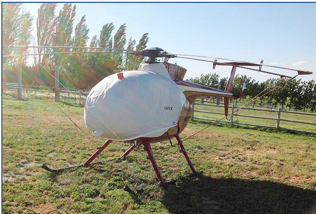
MD500D Bubble Cover with Intake Add-On