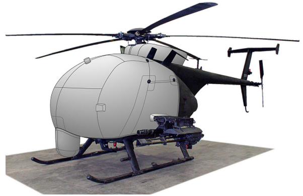
MH-6J Bubble, Flir & Doghouse Covers (illustration)