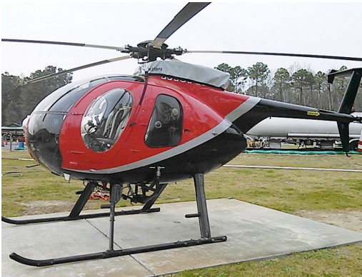
Customized Engine Cover

WINTER USE MATERIAL - Made with Solution-Dyed Polyester fabric, this option is intended for seasonal use to aid in deicing, rain mitigation, or for occasional travel. The material is lighter and more compact, but more susceptible to UV damage and may have a shorter useful life if used continuously outside than the all-year use material.