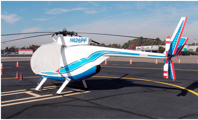
MD500C Bubble Cover with Wire Strike detail