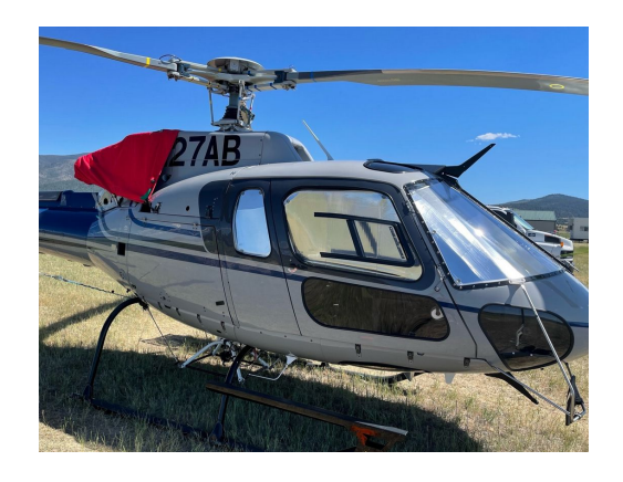
Eurocopter AS350-B3 Cabin HeatShields, Intake/Exhaust Cover