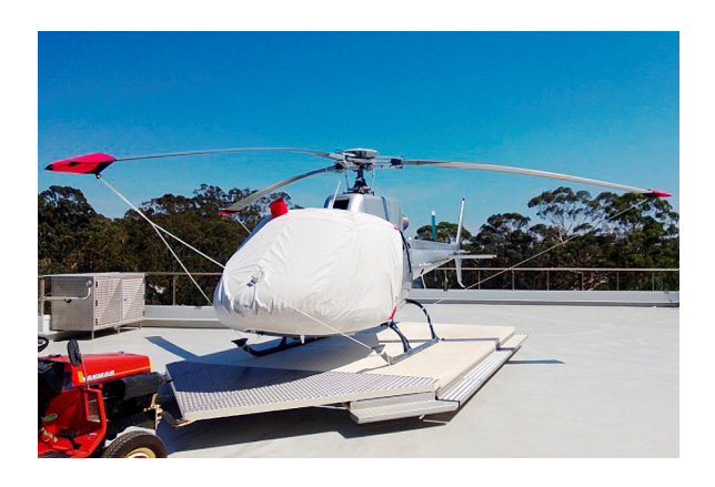
AS350 Bubble Cover, Blade Tie-downs