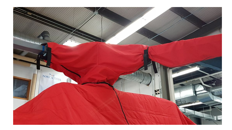
H125 MAIN ROTOR HUB COVER

WINTER USE MATERIAL - Made with Solution-Dyed Polyester fabric, this option is intended for seasonal use to aid in deicing, rain mitigation, or for occasional travel. The material is lighter and more compact, but more susceptible to UV damage and may have a shorter useful life if used continuously outside than the all-year use material.