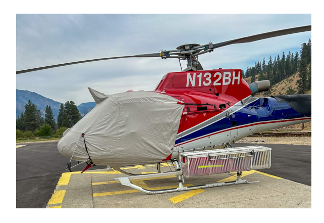
Eurocopter AS350-B3 Bubble Cover w/Wire Strike & Cargo Mirror details.