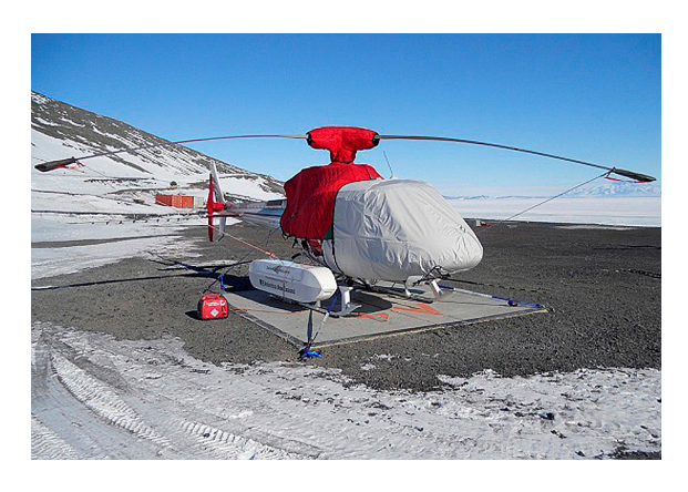
AS350 Bubble Cover w/ Cargo Mirror, Blade Tie-downs, Insulated Engine, Insulated Main Rotor Hub & Insulated Tail Rotor Covers