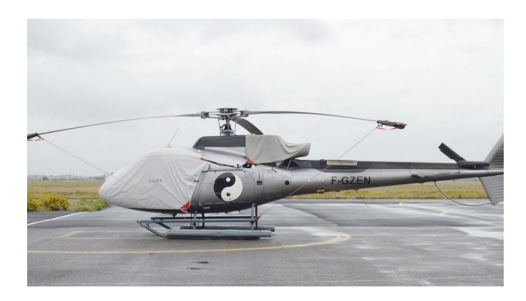
Airbus Helicopter AS350 Bubble Cover & Intake/Exhaust Cover