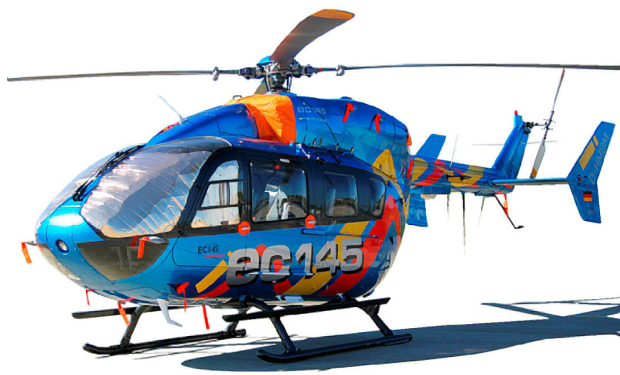
EC-145 Cabin Heatshield Set

Heatshields are interior sunshades for an aircraft's windows or canopy glass. The product is a unique composite of closed-cell foam with a silver mylar finish. The semi-rigid design is stiff enough to stand along the inside of the windshield using sun visors or window framing. It folds up flat and easily stores in the included storage sleeve. Some designs may require velcro and suction cups. A Heatshield is an excellent short-term remedy for cockpit overheating.