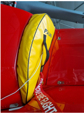
Airbus Helicopter H145D3 Intake Plugs