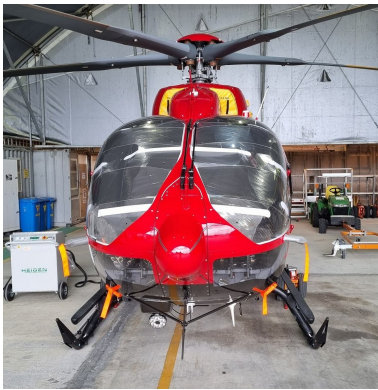
Airbus Helicopter H145D3 Windshield Heatshields, Engine Plugs

The Engine Inlet Plugs are custom fit for your Airbus Helicopter H145, UH-145, BK-117 D-2, D-3 intakes, made with heavy-duty vinyl material, and stuffed with a single block of sculpted urethane foam. Each plug has a zipper that allows the foam to be removed and dried if necessary. Engine plugs have 'Remove Before Flight' streamers sewn onto the face of the plugs. Most plugs are imprinted with the aircraft registration number in black for an extra charge. Storage bag NOT included. Engine plugs may be inserted after flight when the engine is still warm. Engine Inlet Plugs are commonly referred to as Cowl Plugs, Intake Plugs, Cowl Blocks, Engine Blocks, and Engine Bungs.