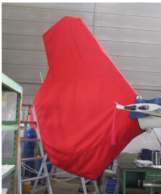
Airbus EC145 Tailfan Housing Fenestron Cover

The Tailboom Cover details vary by model, but generally the helicopter tail boom cover encloses the tail boom from the "bottleneck" to the aft end. They usually also cover the horizontal stabilizers, and are custom made to allow for antennae, lights, and other protrusions. They attach with straps underneath the tail boom. Covers for the vertical and horizontal stabilizers are also available separately. Specific information for each model is available on request.