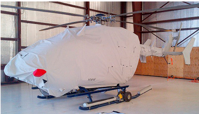
Main Body (also covers bottom), Tailboom, Vertical Pylon, Stabilizers and Tail Rotor Covers