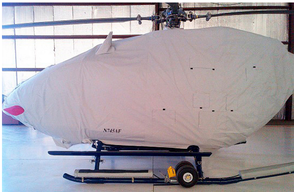
Eurocopter EC-145 Main Body Cover, also covers the bottom belly

This cover type is made from Silver Acrylic Sunbrella canvas and is 100% lined with a soft and smooth microfiber. Bruce's Custom Covers developed this material combination especially for aircraft protection. The outer material is medium weight and treated for water resistance, UV resistance and anti-static buildup. The inner lining is a very soft and smooth microfiber to prevent scratching. The material is very reflective, and tests show that the cabin interior temperature can be reduced to near-ambient temperature on the hottest of days. It is water, ice and snow repellent, yet breathable to allow moisture to escape from between the cover and the aircraft surface.