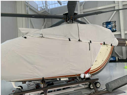
Eurocopter 145 Engine Area Cover, Bubble Cover

The Engine Inlet Plugs are custom fit for your Airbus Helicopter H145, UH-145, BK-117 D-2, D-3 intakes, made with heavy-duty vinyl material, and stuffed with a single block of sculpted urethane foam. Each plug has a zipper that allows the foam to be removed and dried if necessary. Engine plugs have 'Remove Before Flight' streamers sewn onto the face of the plugs. Most plugs are imprinted with the aircraft registration number in black for an extra charge. Storage bag NOT included. Engine plugs may be inserted after flight when the engine is still warm. Engine Inlet Plugs are commonly referred to as Cowl Plugs, Intake Plugs, Cowl Blocks, Engine Blocks, and Engine Bung.