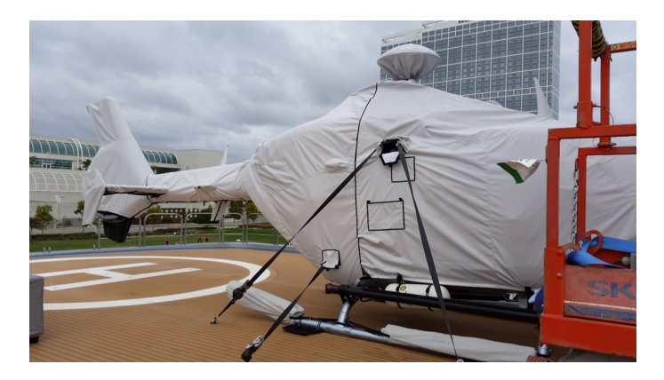
EC-135 Full Cover Set