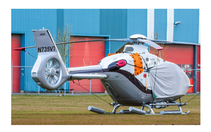
Airbus EC135T3 Blade Tie-Downs