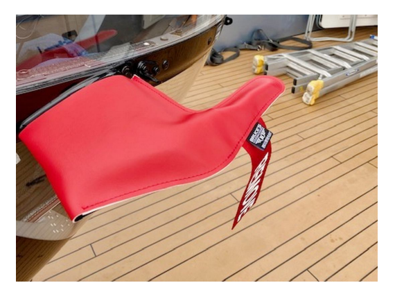
Airbus Helicopter H145 Pitot Tube Cover