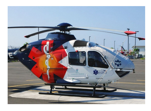
Eurocopter EC-135 Windshield/Skylight Cover