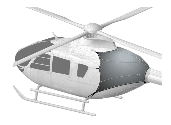
EC135 Exhaust Area Cover, illustration