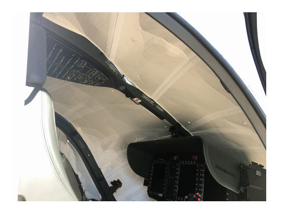
Eurocopter EC-145 Cockpit Heatshields

Heatshields are interior sunshades for an aircraft's windows or canopy glass. The product is a unique composite of closed-cell foam with a silver mylar finish. The semi-rigid design is stiff enough to stand along the inside of the windshield using sun visors or window framing. It folds up flat and easily stores in the included storage sleeve. Some designs may require velcro and suction cups. A Heatshield is an excellent short-term remedy for cockpit overheating.