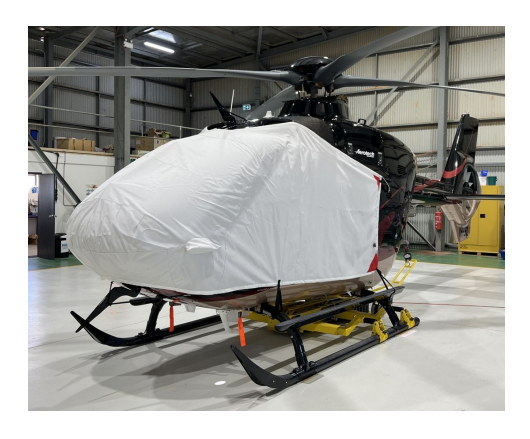
Airbus EC-135 Bubble Cover (with Wire Strike)