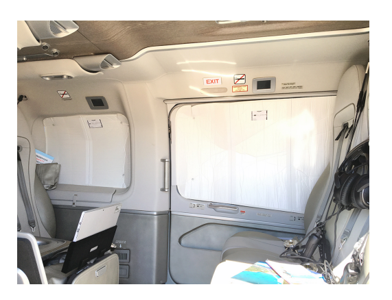
Eurocopter EC-145 Cabin Heatshields