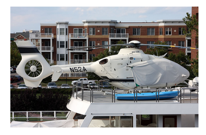
Eurocopter EC-135 Bubble Cover

This cover type is made from Silver Acrylic Sunbrella canvas and is 100% lined with a soft and smooth microfiber. Bruce's Custom Covers developed this material combination especially for aircraft protection. The outer material is medium weight and treated for water resistance, UV resistance and anti-static buildup. The inner lining is a very soft and smooth microfiber to prevent scratching. The material is very reflective, and tests show that the cabin interior temperature can be reduced to near-ambient temperature on the hottest of days. It is water, ice and snow repellent, yet breathable to allow moisture to escape from between the cover and the aircraft surface.