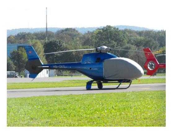
EC-130 Bubble, Tailfan, and Rotor Hub Cover