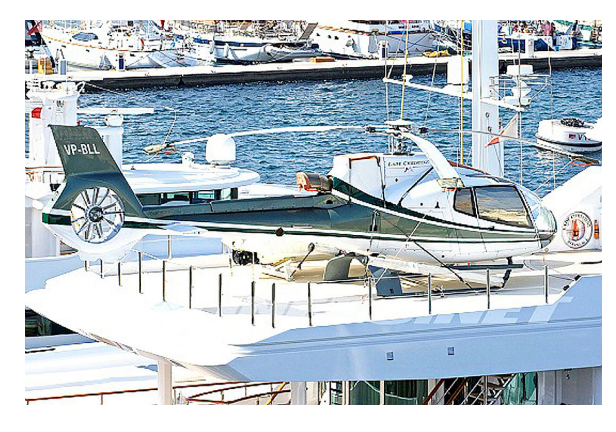
EC-130 Front, Side and Skylight Window HeatShields