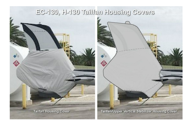
Airbus Helicopter H-130 Tailfan Housing Covers