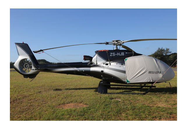
EC-130 Bubble Cover