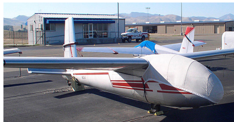
Blanik L13 Canopy/Nose Cover

the hottest of days. It is water, ice and snow repellent, yet breathable to allow moisture to escape from between the cover and the aircraft surface.