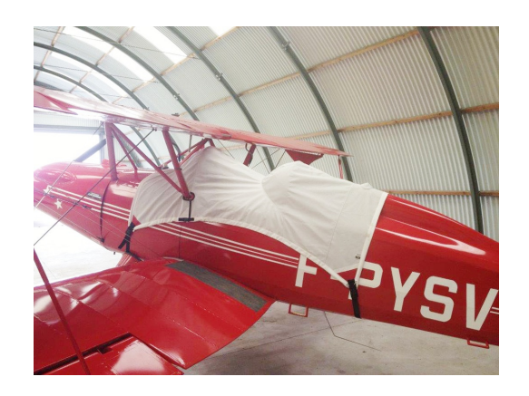
Starduster Too Canopy Cover