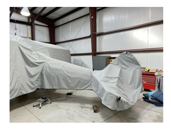
Stearman PT-13 Full Body Dust Cover, Prop Cover Included