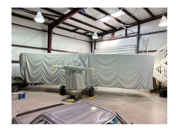
Stearman PT-13 Full Body Dust Cover

Some high value aircraft end up logging lots of hangar time, and become dust magnets in the process. A high quality, well fitting dust cover provides easy assurance that the aircraft's surfaces remain clean and free of grit and grime. Available in a large variety of colors, each dust cover is custom made according to aircraft details and customer preferences. Fire retardant fabrics are also available.