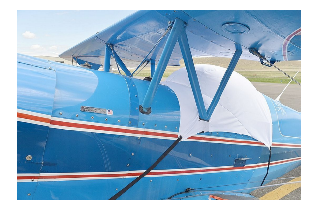
Acro Sport Acro II, Acroduster Travel Cover, Light Weight Travel Canopy Cover