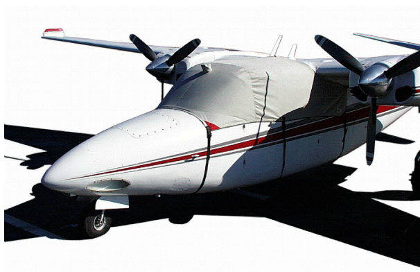
Aero Commander 680 Canopy Cover