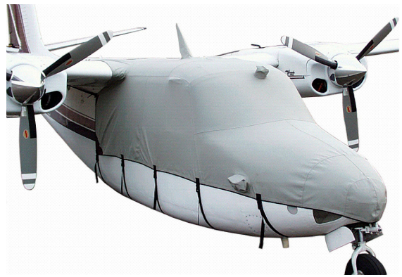
Canopy/Nose Cover (extends over top past leading edge)