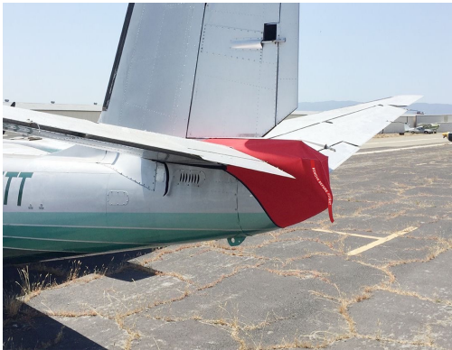
Rockwell Aero Commander Tailcone Cover