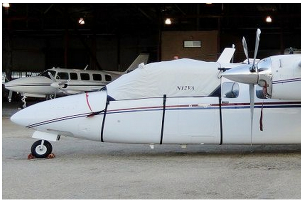
Rockwell Aero Commander 685, 690 & 840 Cockpit Cover