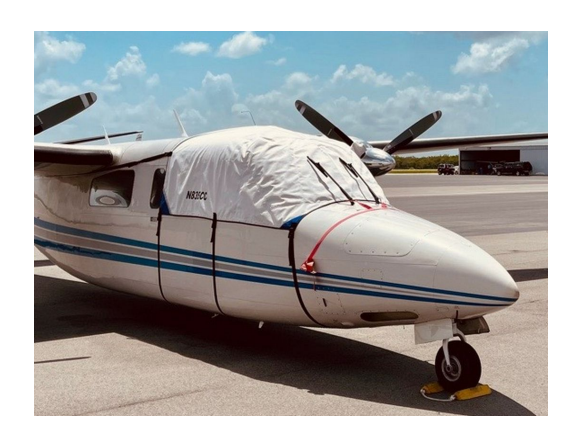
Aero Commander 690C Cockpit Cover