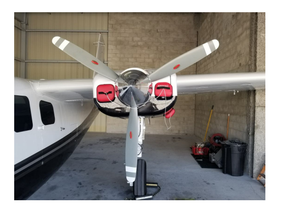
Aero Commander 500-A Engine Plug Set