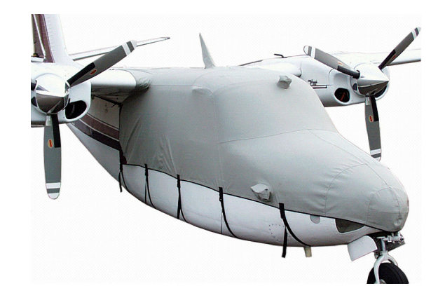
Aero Commander 690b Canopy Cover