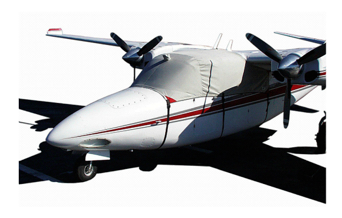
Aero Commander 680 Canopy Cover