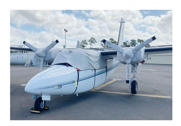
Aero Commander 500S Shrike Canopy, Engine & Prop Covers