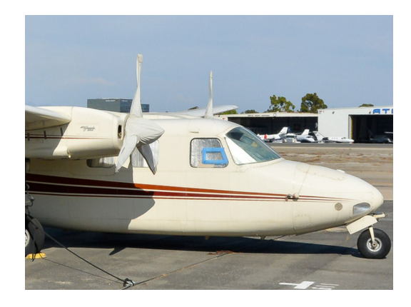
Aero Commander AC500 Ptopellor/Spinner Covers

This cover type is made from Silver Acrylic Sunbrella canvas and is 100% lined with a soft and smooth microfiber. Bruce's Custom Covers developed this material combination especially for aircraft protection. The outer material is medium weight and treated for water resistance, UV resistance and anti-static buildup. The inner lining is a very soft and smooth microfiber to prevent scratching. The material is very reflective, and tests show that the cabin interior temperature can be reduced to near-ambient temperature on the hottest of days. It is water, ice and snow repellent, yet breathable to allow moisture to escape from between the cover and the aircraft surface.