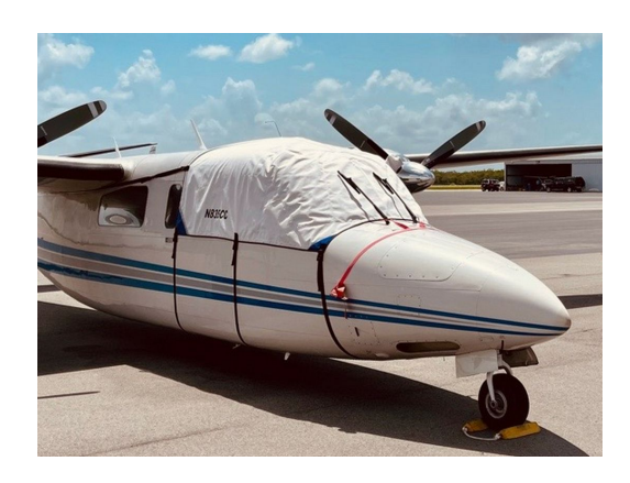
Aero Commander 690C Cockpit Cover