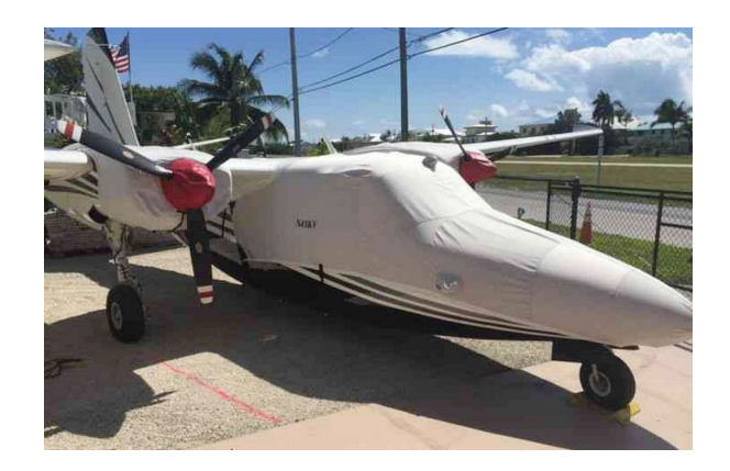
Twin Commander 560F Canopy/Nose & Engine Covers

This cover type is made from Silver Acrylic Sunbrella canvas and is 100% lined with a soft and smooth microfiber. Bruce's Custom Covers developed this material combination especially for aircraft protection. The outer material is medium weight and treated for water resistance, UV resistance and anti-static buildup. The inner lining is a very soft and smooth microfiber to prevent scratching. The material is very reflective, and tests show that the cabin interior temperature can be reduced to near-ambient temperature on the hottest of days. It is water, ice and snow repellent, yet breathable to allow moisture to escape from between the cover and the aircraft surface.