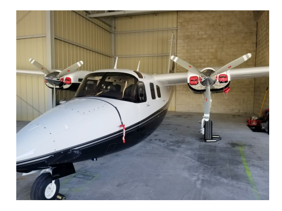
Aero Commander 500-A Pitot Covers

Engine Inlet Plugs are custom fit for your Rockwell Commander 500, 520, 560, Short 680 intakes, made with heavy-duty vinyl material, and stuffed with a single block of sculpted urethane foam. Each plug has a zipper that allows the foam to be removed and dried if necessary. Engine plugs have warning flags that are visible from the cockpit or 'remove before flight' streamers sewn onto the face of the plugs. Most plugs are imprinted with the aircraft registration number in black for an extra charge. Storage bag NOT included. Engine plugs may be inserted after flight when the engine is still warm. Engine Inlet Plugs are commonly referred to as Cowl Plugs, Intake Plugs, Cowl Blocks, Engine Blocks, and Engine Bungs.