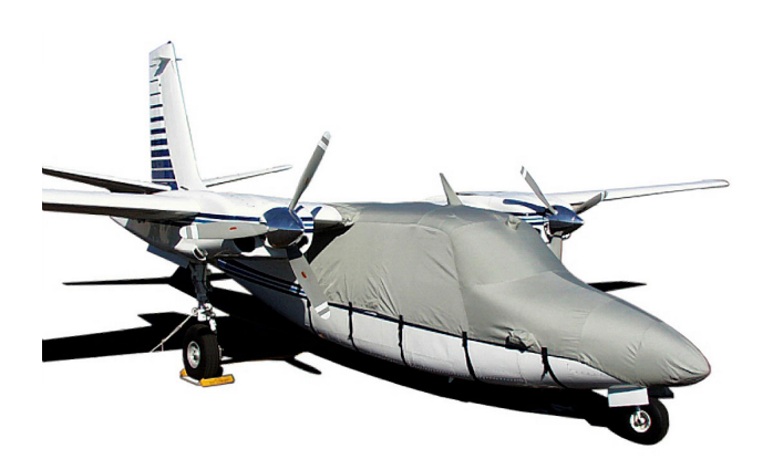
Aero Commander 500S Canopy/Nose Cover