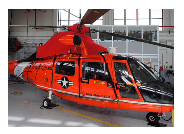
MH-65C Engine Area Cover, Swash Plate Aperture, Rotor Hub cover set, P/N: A365-210