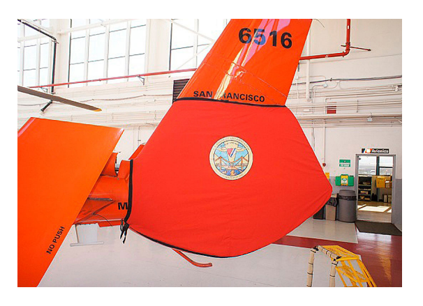
MH-365C Dauphin Tail Fan Fenestron Cover