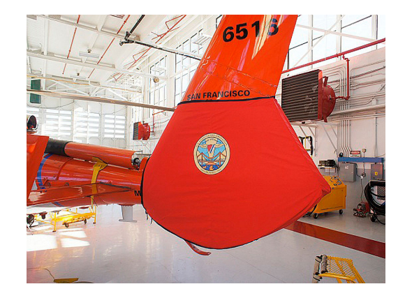
MH-365C Dauphin Tail Fan Fenestron Cover

The Tailboom Cover details vary by model, but generally the helicopter tail boom cover encloses the tail boom from the "bottleneck" to the aft end. They usually also cover the horizontal stabilizers, and are custom made to allow for antennae, lights, and other protrusions. They attach with straps underneath the tail boom. Covers for the vertical and horizontal stabilizers are also available separately. Specific information for each model is available on request.