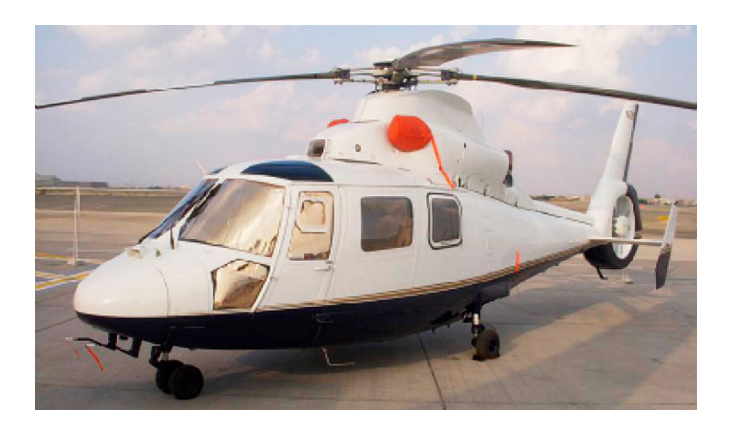
Dauphin HeatShield Set

Heatshields are interior sunshades for an aircraft's windows or canopy glass. The product is a unique composite of closed-cell foam with a silver mylar finish. The semi-rigid design is stiff enough to stand along the inside of the windshield using sun visors or window framing. It folds up flat and easily stores in the included storage sleeve. Some designs may require velcro and suction cups. A Heatshield is an excellent short-term remedy for cockpit overheating.