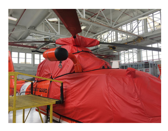
U.S. Coast Guard HH-65 Dolphin Bubble, Engine & Rotor Mast Covers U.S. Coast Guard HH-65 Dolphin Bubble, Engine & Rotor Mast Covers