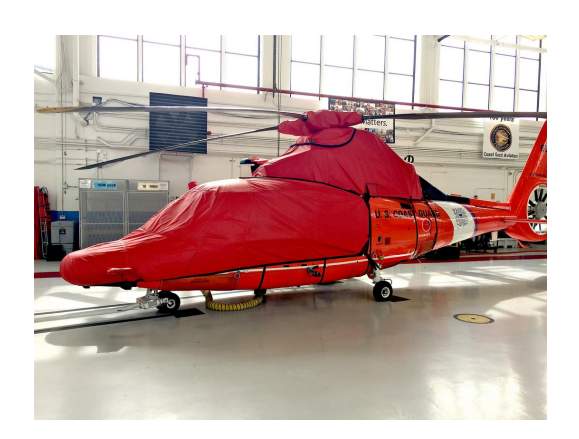
U.S. Coast Guard HH-65 Dolphin Bubble, Engine & Rotor Mast Covers