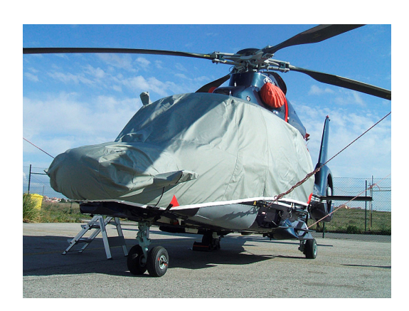
Dauphin Bubble Cover, extended nose

Travel Covers are made with Silver Solution-Dyed Polyester fabric and fully lined over the entire cover. The material is lightweight and more compact for easy stowage in the aircraft. The polyester material is water resistant, but only intended for occasional use outside. We also have an ultra lightweight material available for fitted hangar dust covers. For daily outdoor use, the non-travel Sunbrella Cover is the best choice.