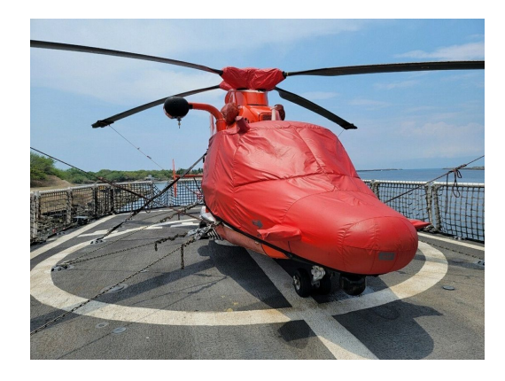
Aerospatiale AS365N2 Bubble, w/Extended Nose/Radome

Insulated Covers Material - A special composite material of solution-dyed polyester, 3M Thinsulate insulation, and soft nylon interior fabric. Our insulated covers are designed to complement an engine preheater and help retain heat in the engine compartment after shutdown. If you operate your aircraft in cold-weather, these covers will help prevent engine wear and tear.