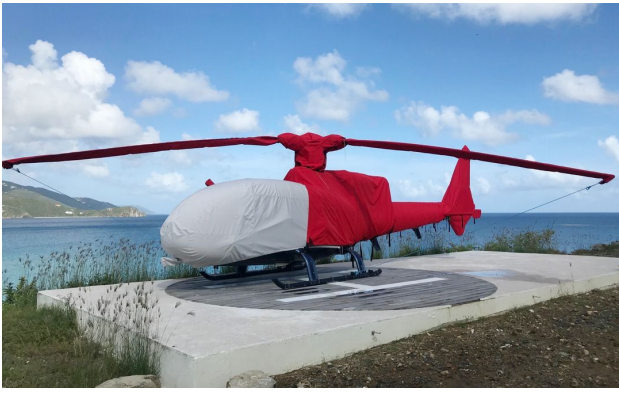
Aerospatiale AS341/342 Gazelle Full Cover Set