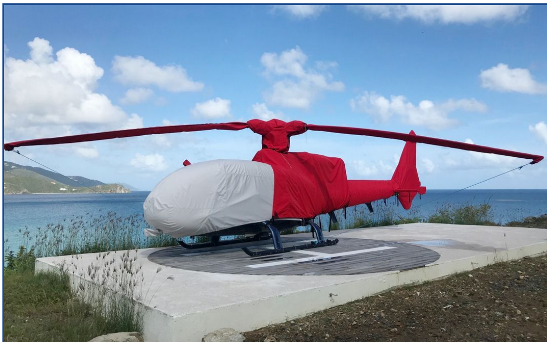
Aerospatiale AS341/342 Gazelle Full Cover Set