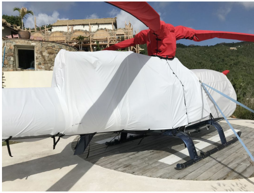
Aerospatiale Gazelle AS341 Bubble, Rotor Mast, Blade, Engine & Tailboom Covers (some are test fit covers)