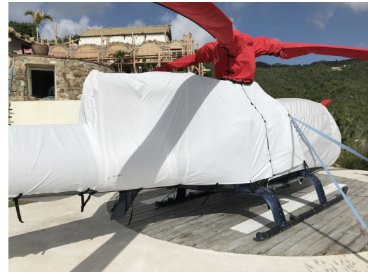
Aerospatiale Gazelle AS341 Bubble, Rotor Mast, Blade, Engine & Tailboom Covers (some are test fit covers)