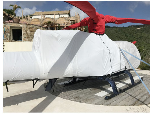
Aerospatiale Gazelle AS341 Bubble, Rotor Mast, Blade, Engine & Tailboom Covers (some are test fit covers)